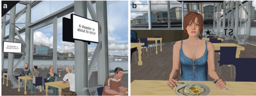
Fig. 13.2 Virtual restaurant