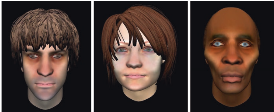
Fig. 13.3 AVATAR Therapy

Virtual reality can also be used for developing novel therapeutic interventions. Leff et al. (2013) created a new approach to the treatment of auditory hallucinations, which they called ‘AVATAR Therapy’. Patients suffering from auditory hallucinations often feel hallucinatory voices to be powerful and able punish the patient when ignoring its commands. With CBT patients learn to conduct behavioral experiments showing the voices to be uncomfortable but otherwise harmless. The AVATAR Therapy research group developed a computerized system that enables patients to create an avatar, as to give a face to go with their persecutory auditory hallucinations, and the therapist can modify his or her voice to talk with patients through the avatar. This enables a dialog between patient and this virtual persecutor. The therapist controls the attitude of the avatar towards the patient. Gradually the therapist changes the attitude of the avatar towards the patient from controlling to yielding, giving the patient more control in the dialogue. This proof of concept study and the recent pilot study (Craig et al. 2014) show promising results. The AVATAR therapy is currently being tested in a larger controlled study in the Institute of Psychiatry, Psychology and Neuroscience (King’s College London) and the results are expected by 2017. Some replications of the AVATAR therapy study can be seen in Fig. 13.3.