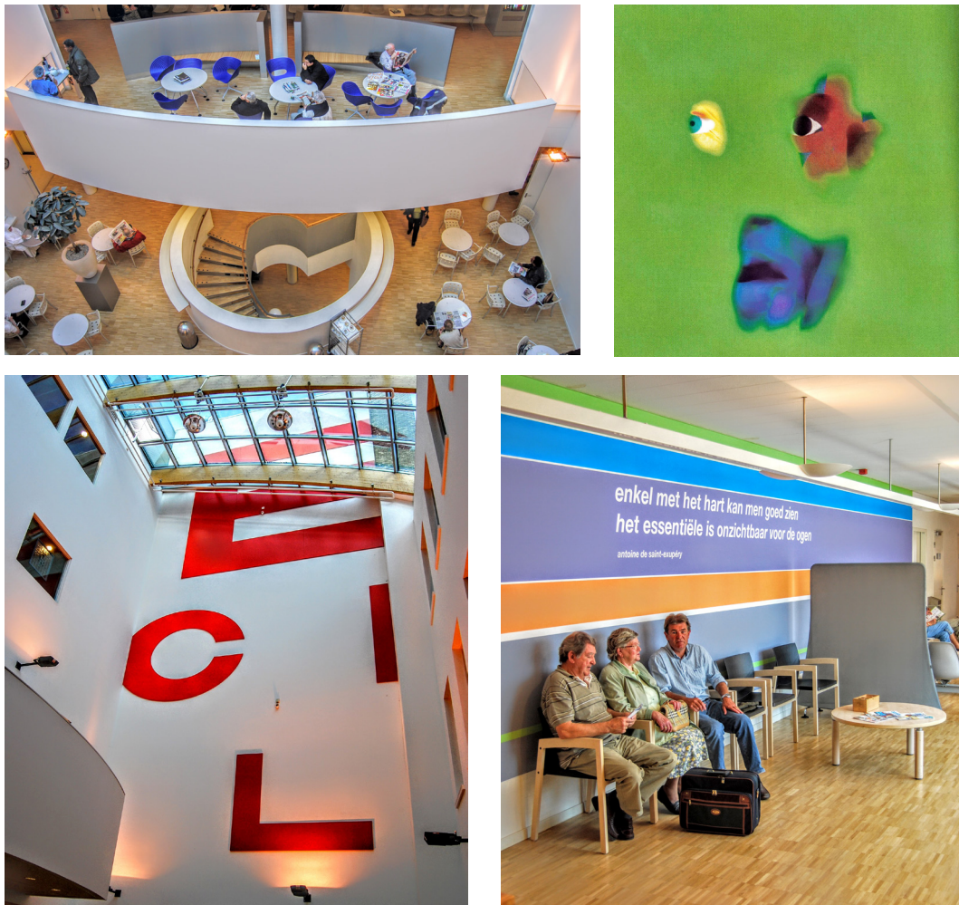
Figure 2: Eye Hospital, Rotterdam, the Netherlands.

The spatial lay-out (above left), paintings (above right), and the patio (below left) show that this is not just a building, but an eye hospital. The waiting room (below right) shows two quotes by Antoine de Saint-Exupéry: 'one can only see with the heart', and 'what is essential is invisible for the eyes', in order to distract visitors from worrying about their eye problems. All these clues are meant to make patients feel comfortable and less stressed.