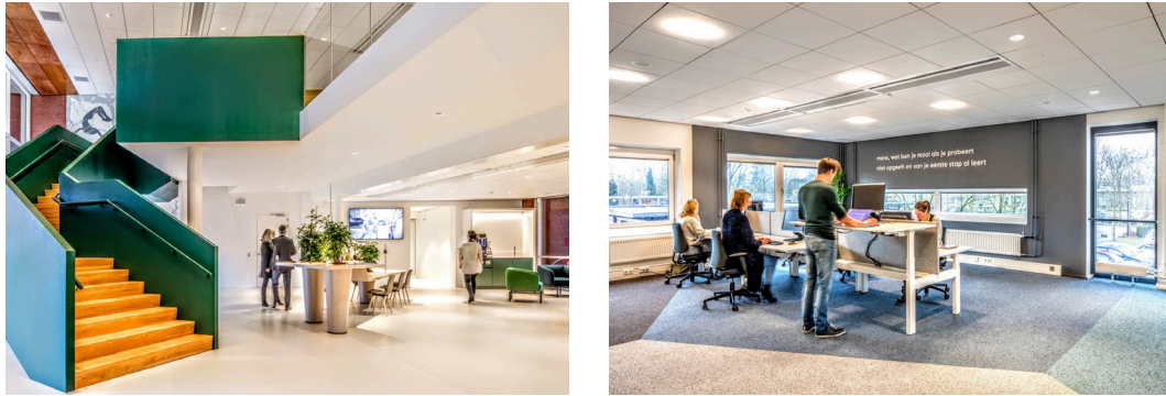
Figure 3: Menzis Building, Enschede, the Netherlands. Menzis is a Dutch health insurance company, that puts much effort in providing a healthy work environment, by a healthy indoor climate, physical activity, a sound balance between collaboration and concentration, sufficient rest and relaxation, autonomy in ways of working, and healthy food. Design choices regard, inter alia, a clear zoning system, a variety of (small clusters of) activity-based workplaces, advanced acoustics, relaxation spaces, sit-stand desks, welcoming staircases, living rooms, attractive sanitary provisions, natural forms and materials, a nice outdoor terrace, reduction of travel time, and a focus on people. Photos by Wouter van der Sar. Printed with permission.