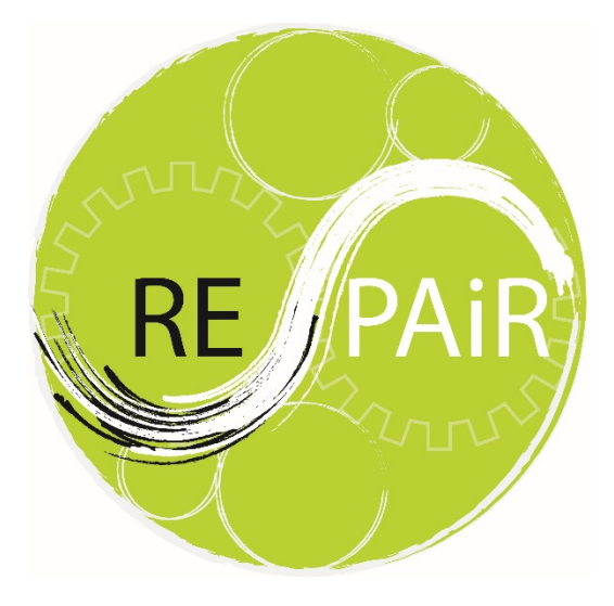
Fig. 1. Logo - colour version