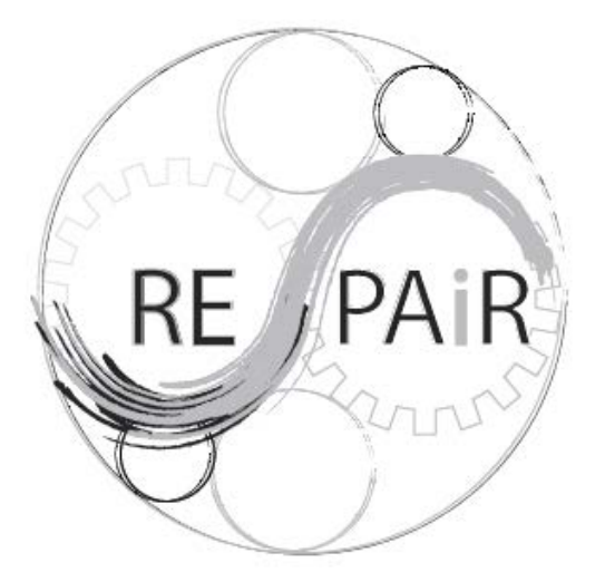
Fig. 2. Logo - black and white version