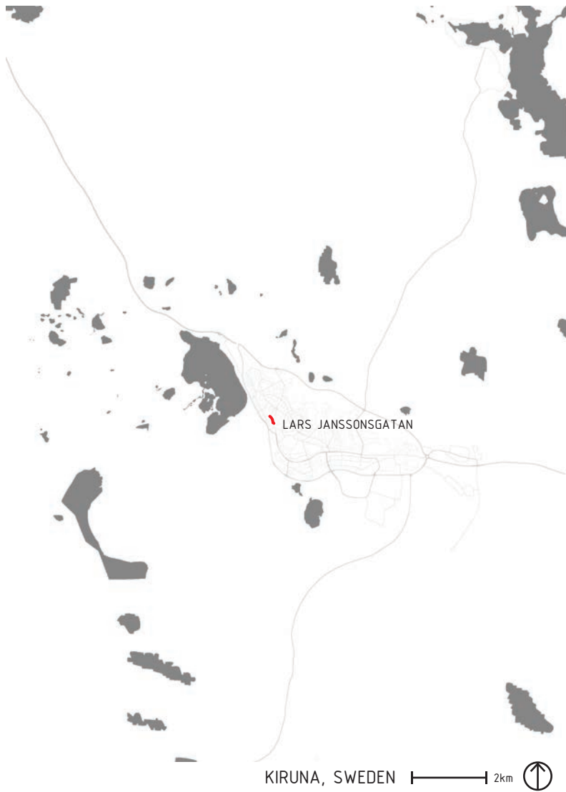
Figure 10.0: Map of Kiruna