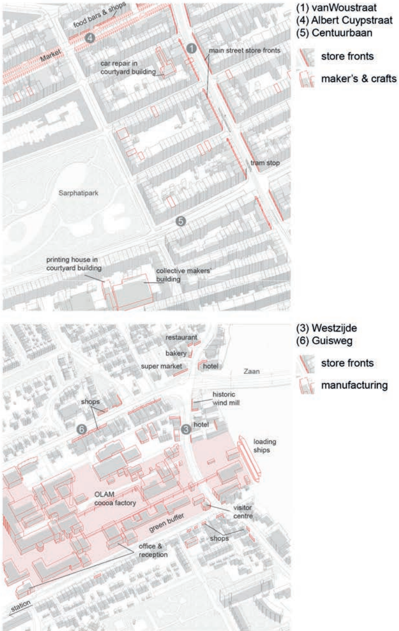
Figure 9.5: Spatial organisation of diverse functions on vanWoustraat (top) and Westzijde (bottom). © Hausleitner and Stuyt 2022