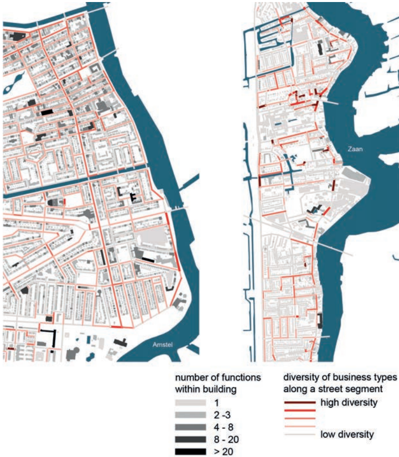
Figure 9.3: Degree of mixed-use buildings and mixing in street segments in vanWoustraat-Rijnstraat (left) and Westzijde (right). © Hausleitner 2022