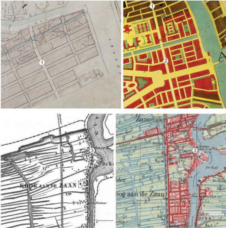
(1) vanWoustraat (2) Rijnstraat (3) Westzijde