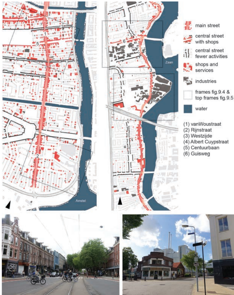
Figure 9.1a: Location of the main streets parallel to the main waterways, including main commercial and industrial activities

mix of residential, commercial, retail and service functions; industrial activities are usually excluded by functional zoning. The second, Westzijde, comprises fragments of industrial typologies and uses that are integrated with residential and commercial facilities. The historical evolution of the two streets is significant, as it is indicative of the type of mix that residents expect on their everyday street, which influences