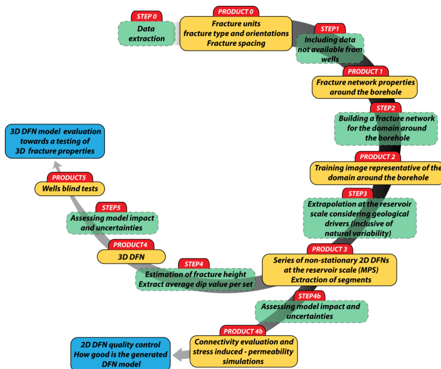
Figure 1: workflow used to generate and assess 2D and 3D discrete fracture network using MPS-based method. The workflow is optimised for a subsurface case study.

As fractures are 3D objects and because their volumetric organisation is likely to play a role in fluid flow, we developed a simple method to extrude fracture surfaces from a 2D realisation. This method assumes that a fracture plane has a finite vertical dimension which is explicitly defined by the user. This vertical dimension is materialised by the use of equiprobable DFN simulations (different networks) shifted in the Z direction. The method produces vertical or oriented fractures. The validity of the 3D DFN was assessed using the well blind test method.