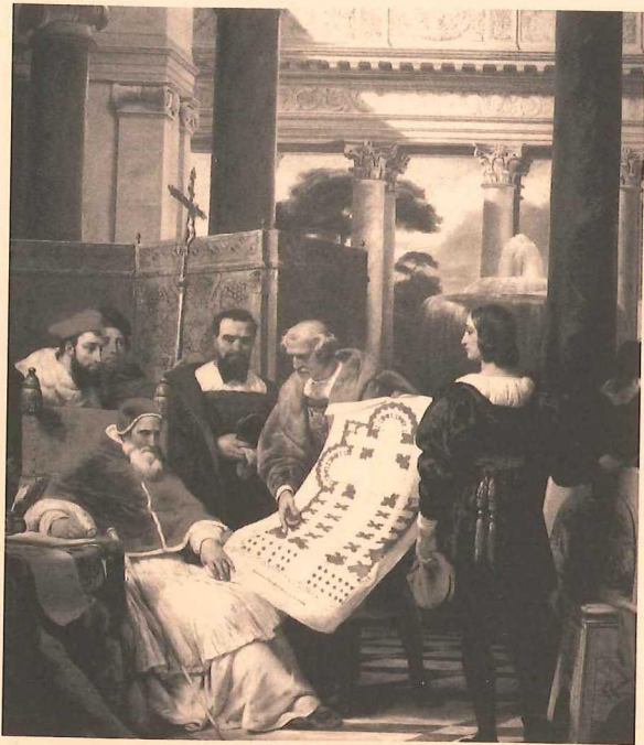
Pope Julius II ordering Bramante, Michelangelo, and Raphael to construct the Vatican and St Peter's Painting by Emile Jean-Horace Vernet