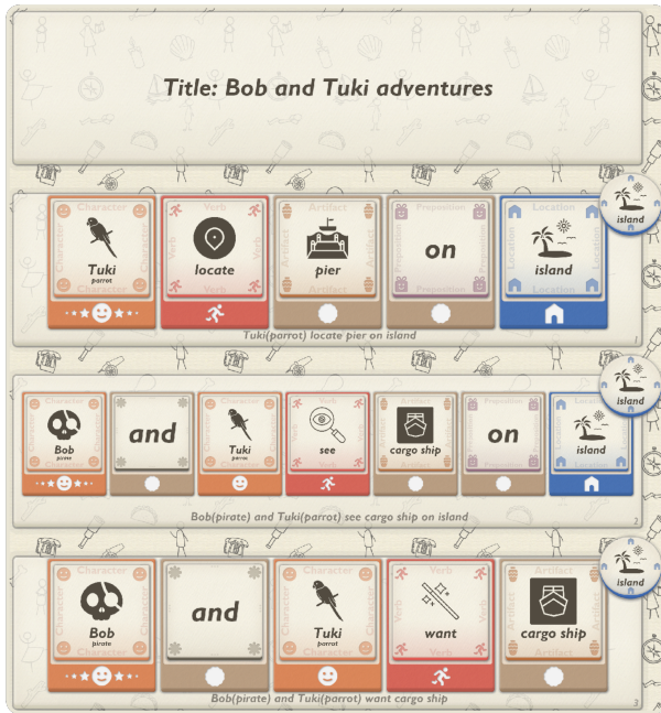
Figure 2: Visual story retrieved from TaleMaker's database of stories.

the story, the process is repeated by another player, who introduces two new characters and a new location.