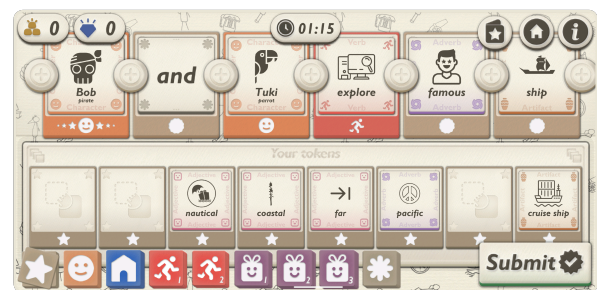
Figure 1: TaleMaker sentence composition: players create a plot point by dragging and dropping tokens from their collection (below) into the appropriate slots (above).

FDG '22, September 5–8, 2022, Athens, Greece © 2022 Copyright held by the owner/author(s). ACM ISBN 978-1-4503-9795-7/22/09. https://doi.org/10.1145/3555858.3555910