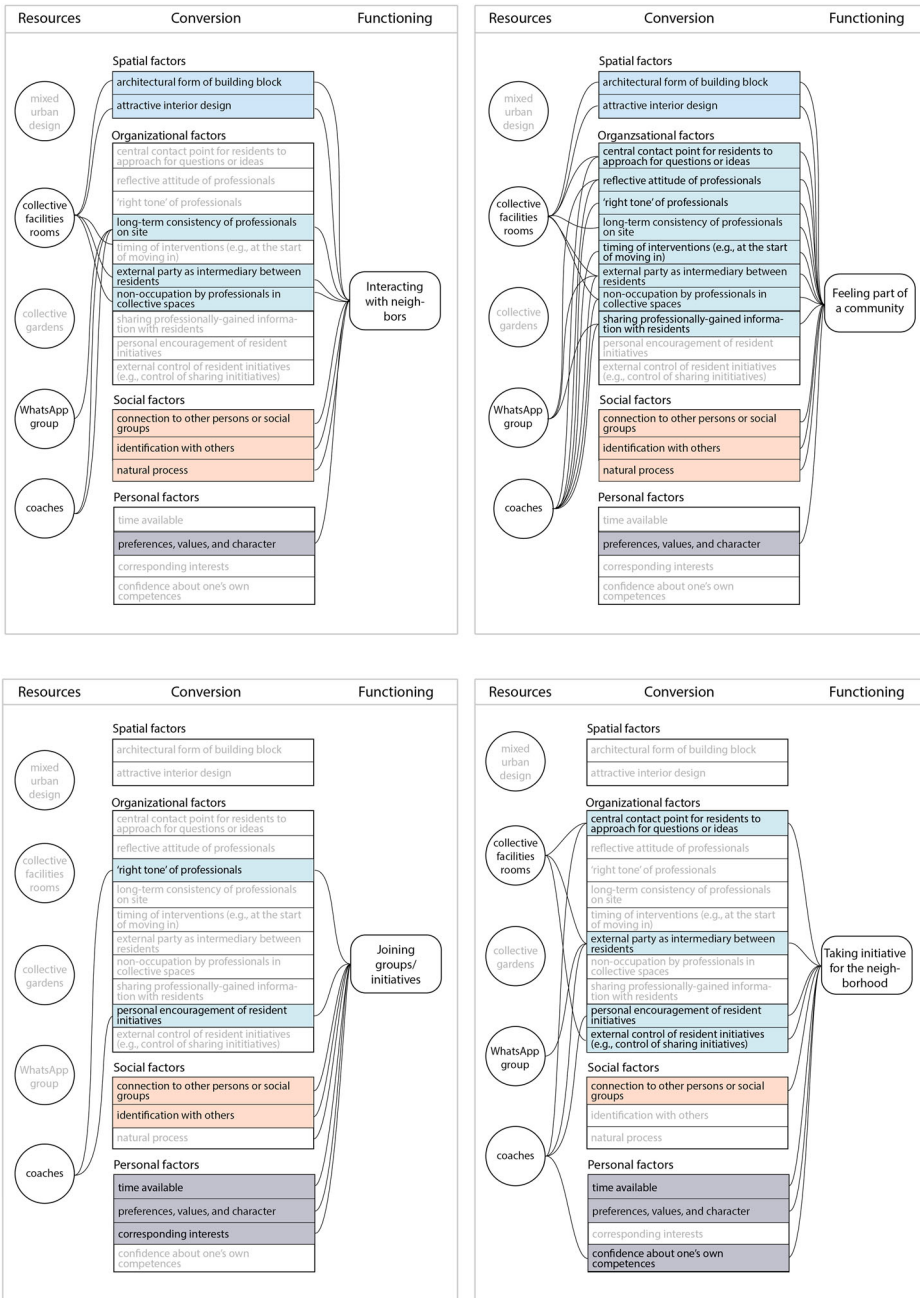
Figure 2. Conversion factors that inhabitants experienced between resources and actual performance of four functionings.

– much valued by the interviewed planners – may be experienced very differently ‘on the ground’: privacy and anonymity may be valued just as much as, or more than, social interaction. Likewise, contributing to a collective aim may be valued as much as preserving one’s own independency. This and other observations are collected in Table 2 .