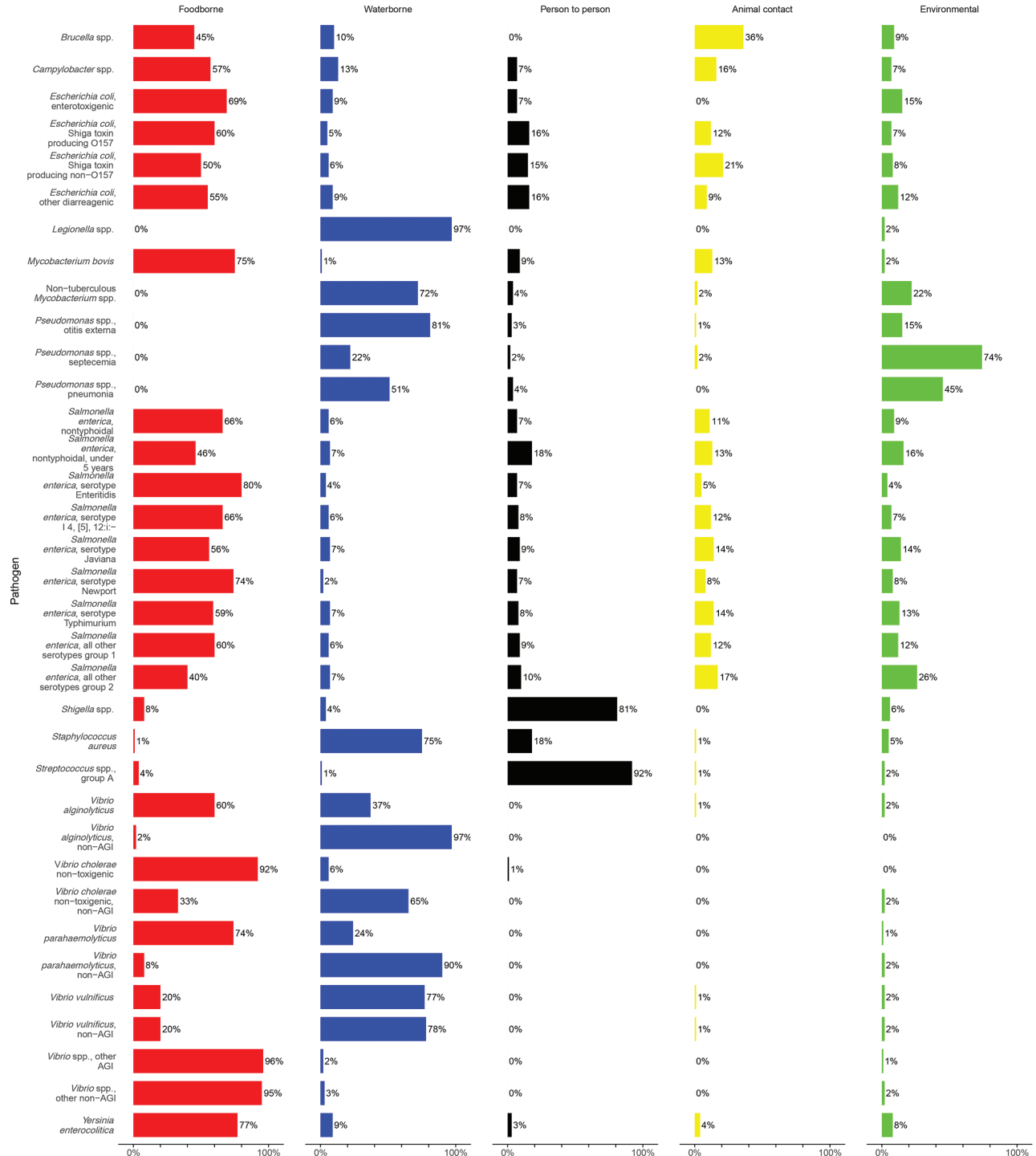
Figure 2. Source attribution results for major transmission pathways of bacteria in study of attribution of illnesses transmitted by food and water to comprehensive transmission pathways using structured expert judgment, United States, 2017.

represent scenarios at the boundaries among different transmission pathways. For 17 (85%) questions, >75% of participants answered with the correct major pathway, and of these questions, 13 (76%) were answered with the correct subpathway as well (Appendix 4).