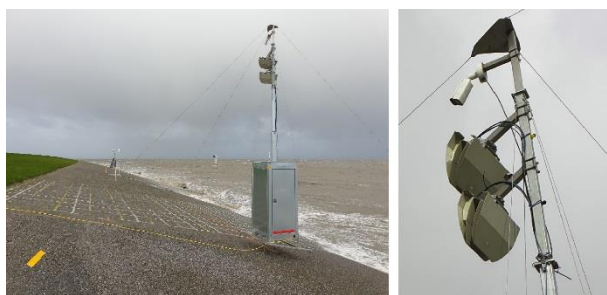
Figure 2 - Left: New laser scanner system next to the overtopping tanks on the dike in the Eems-Dollard estuary. Right: from the bottom to the top: Laser scanner 1, laser scanner 2, video camera.

The goal of the paper is to further validate this innovative system for measuring wave run-up heights, depths and front velocities, and for determining the wave overtopping, (peak) wave period and angle of incidence during an actual severe winter storm with very oblique wave attack. To this end, the paper will describe the analysis of the data obtained during storm Ciara (10 - 12 February 2020). Furthermore, the laser scanner results will be validated with data from the overtopping tanks and video recordings. Finally, the data gathered during storm Ciara will be compared to the current knowledge on wave overtopping, to possibly gain new insights in the influence of very oblique wave attack on wave overtopping.