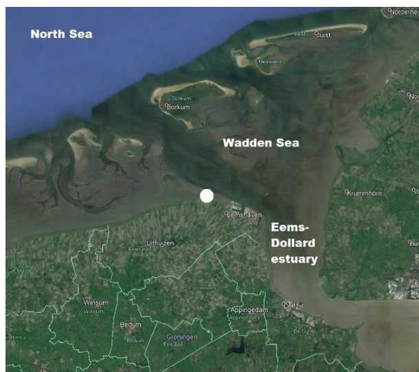
Figure 1 - The Eems-Dollard estuary in the Netherlands, area of interest of the field measurement project. Laser scanner system location indicated by white dot.

An extensive field measurement project is being performed in the Eems-Dollard estuary in the north of the Netherlands for a period of 12 years. The measurements started in 2018, measuring wind, water levels, waves and wave run-up and overtopping. The estuary consists of deep channels and shallow tidal flats and is part of the Wadden Sea, a shallow shelf sea, see Figure 1. A particular aspect for this area is that the dike design conditions are characterized by very obliquely incident waves, up to 80° relative to the dike normal. As the reliability of the models as used for the Dutch dike safety assessment has not been sufficiently validated for such conditions, the aim of the measurements is twofold. First, to better understand the processes yielding nearshore wave conditions, ultimately leading to improved numerical prediction models. Second, to better understand the processes related to oblique wave run-up and overtopping, leading to improved prediction methods. In the project, the wave overtopping is measured with four wave overtopping tanks built into dikes at two locations. The laser scanner system of Oosterlo et al. (2019) has since been upgraded and has now been placed next to two of the overtopping tanks on the dike in the Eems-Dollard estuary to measure during actual severe winter storms, see Figure 2.