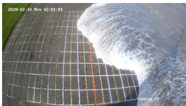
Figure 3 - Snapshot of a very oblique wave running up the slope during storm Ciara.

The focus of the paper will lie on the measurements performed during storm Ciara. Storm Ciara was an extratropical cyclone that hit large parts of northern Europe starting on 7 February 2020. Measurements were performed from 10 to 12 February 2020. Ciara was the first actual storm that was measured with the laser scanner system, and immediately tested the system to the extreme. Ciara was a highly unique storm, with offshore directed wind at the measurement location and waves that turned somewhat on the shallow flats in front of the dike to become almost alongshore directed waves at the dike. Hence, Ciara caused highly complex conditions at the measurement location with very oblique wave attack with angles of incidence up to 75°. This posed large challenges for measuring e.g. the 3D front velocities and the overtopping volumes and discharges, also see Figure 3.