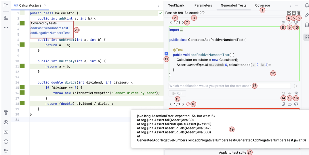
Figure 3: TestSpark 's tests visualization

in this line. Clicking on a test case name or a mutant highlights the test cases in the "Generated Tests" that cover or kill it.