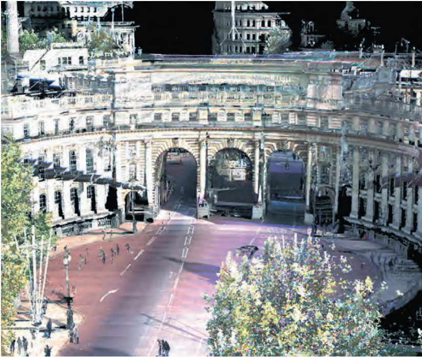
▲ Figure 2: Mobile laser scan of Admiralty Arch on The Mall in London, coloured from simultaneously captured 360-degree panoramic images.

saved directly and connected seamlessly to any PC or server with a USB 3.0 interface. Compression is a prerequisite for prolonged surveys without interruptions since the camera produces imagery with a three times higher resolution compared to standard systems. The side cameras capture eight frames per second (FPS) at a field of view of 61 x 47 degrees. The maximum ground sample distance (GSD) at a distance of 10m from the camera is 3mm. The fish-eye camera system, which consists of two cameras mounted back to back, provides seamless 24MP imagery with a 360-degree field of view. The dual fish-eye camera system is aligned with the laser scanner, enabling colourization of the laser points (Figures 2 and 3).