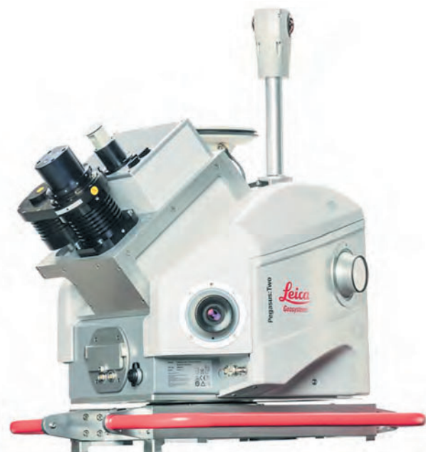
▲ Figure 1: All sensors of the Pegasus:Two Ultimate are rigidly integrated in the same casing; the rack can be mounted on a variety of vehicles including cars (left).