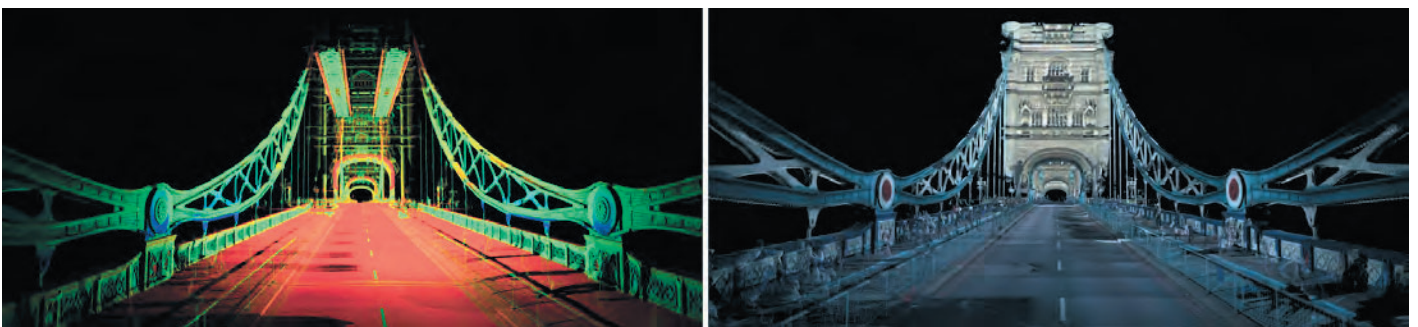
▲ Figure 3: Laser point cloud of Tower Bridge in London, intensity coloured (left) and the point cloud resulting from colourizing from simultaneously captured 360-degree panoramic images.

The relative accuracy of outlines belonging to the same parking zone is better than two