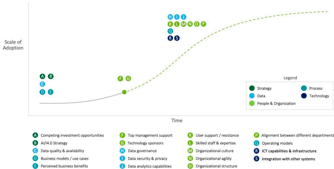
Figure 3. Mapping the factors on stages.

In accordance with the earlier body of literature [16–18,33,41,48,50,51], the findings from the study suggest that the strategic factors tend to be more prominent in the earlier stages of scale-up. As the expert interviews underscore, even before crafting their short-term and long-term business plans, smart cities are often faced with a multitude of opportunities, which seems to drive some organizations into inaction. The study also supports the notion proposed by the earlier works that organizations need to assess their potential use cases and business benefits prior to initiating projects. The research also discovered that data quality and availability are more likely to inhibit scaling efforts much earlier in the process. The lack of data quality seems to deter some smart cities from initiating the project early on in the journey.