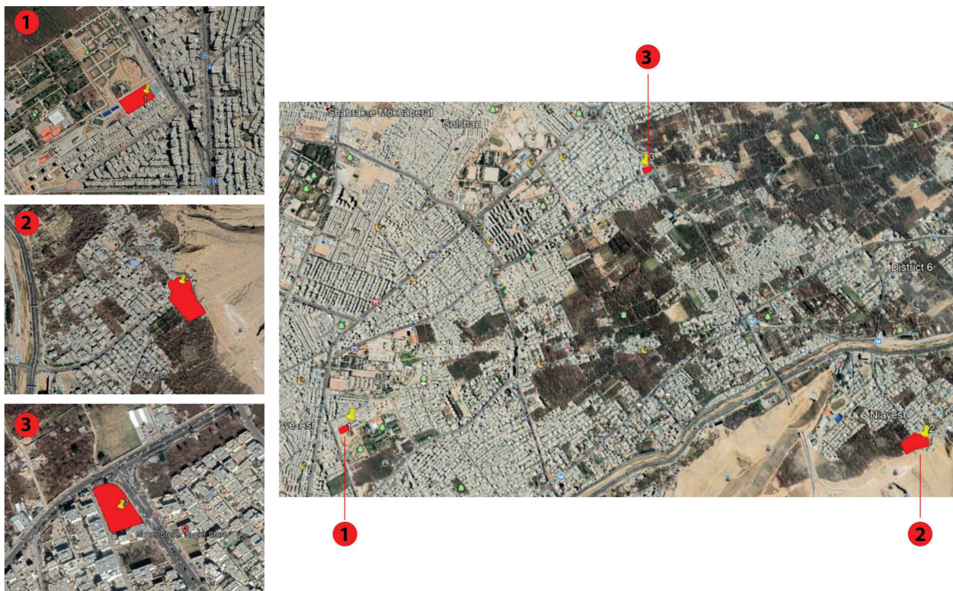
Figure 1. Locations of the selected sites in Shiraz: 1) Be'sat, 2) Niayesh, 3) Ghoddosi.

• Besat Site, District 1: Spanning an area of 2567 hectares, this district hosts a population of 157,624. The site is strategically located near Besat Park and Afif-Abad Garden, the latter of which includes significant historical landmarks such as a royal palace and an ancient weapons museum. Afif-Abad Garden is a recognized Persian garden, recorded in Iran's National Works list, with origins tracing back to 907 AD. While the site benefits from satisfactory access routes, the absence of a nearby metro station poses a limitation. The area is char-