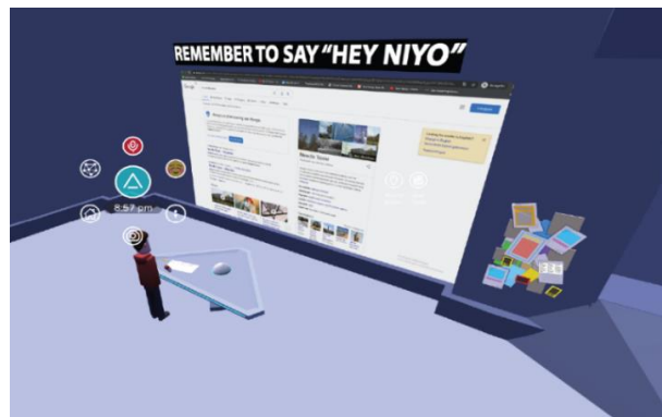
Figure 2. B-Set, session 9: The participant is performing a web research to solve a clue while interacting with the AIA in the custom-built escape room environment.