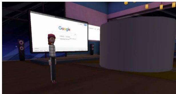
Figure 1. A-Set, session 3: Created using a template SVR environment. The AIA manifestation is an out-of-scale cylinder in the middle of the room.

Upon completion of the escape-room, we carried out 5-15 minute semi-structured interview with each participant. Ultimately, we used participant validation, through member checks (Ravitch & Mittenfeller N, 2015), to have the participants reflect on their experience and perception of the AIA's fidelity level and to verify the level of immersion of the iVP.