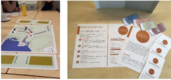
Fig. 1. Prototype of the Trust Game