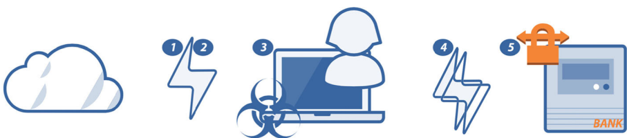
Novel Man-in-the-Browser attack

However, the operated crimeware kit (1) in this case allows the attacker to use dynamic web injects instead of fully automated versions. The infections (2) are identical