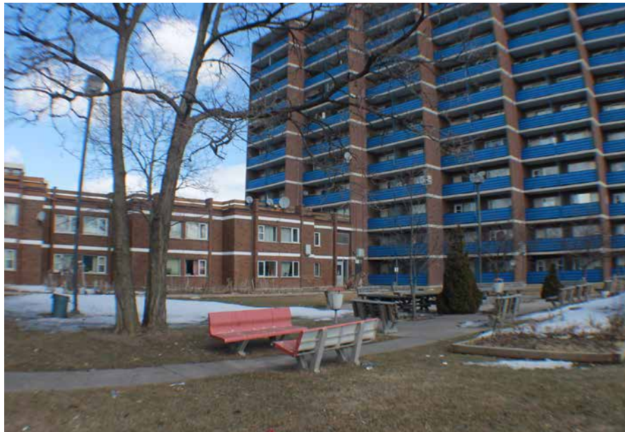
FIGURE 5.2 Examples of two housing types and an open space in Jane-Finch.