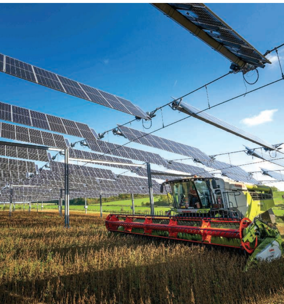
Double-usage of land is demonstrated at this Agrivoltaic site in Amance, France, where the simultaneous use of land for power production and agriculture can also reduce irrigation needs in arid lands.

revenue needed to build and operate a generator over a certain period), where innovations are quickly introduced to the market and where technology transitions happen in months to a few years. Examples of these include hydrogenation for defect control, diamond wire sawing, multibusbars, half-cut cells, and increases in wafer size. The latest tunnel oxide passivated contact silicon (Si) PV technology (commonly known as TOPCON) advanced in 5 years from an industrially relevant laboratory design to commercialization and mass production. Fundamental advances in materials chemistry for cadmium telluride (CdTe) PV have recently also made their way into production in record time. Recent analysis shows that it now takes about 3 years for the average cell efficiency in mass production to reach the efficiency of the champion cell fabricated in the industrial laboratory (6).