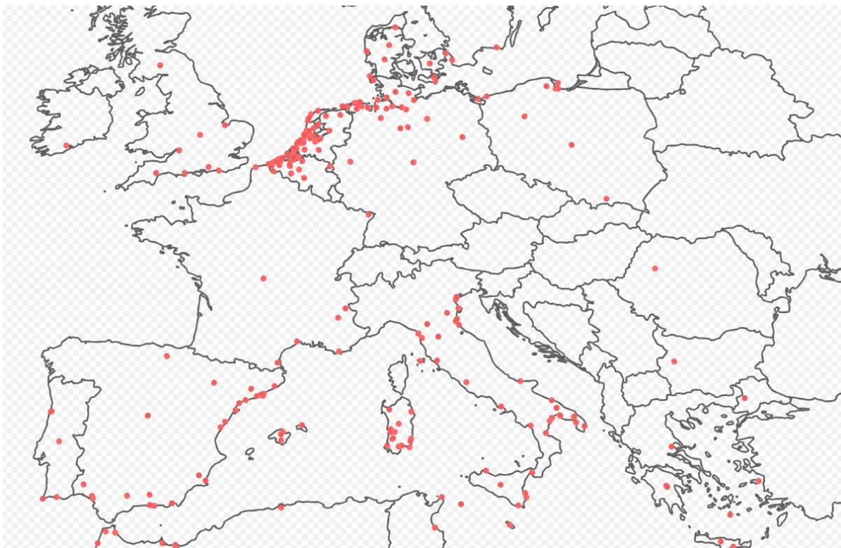
Figure 1 Maps with dots showing the locations of the case studies of saltwater intrusion presented at SWIMs. The main map covers the entire globe, while the inset map is an enlargement of Europe and the Mediterranean region, which have the highest density of studies. When the precise location of a study could not be determined, the dot was placed in the centre of a country.