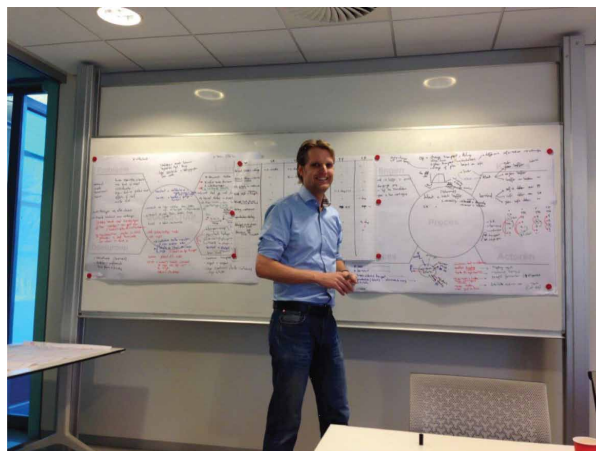
Figure 1. Facilitating a gamestorm session