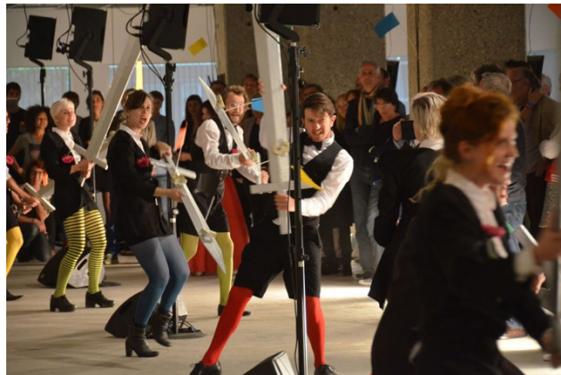
Fig. 2. Impression of the Parsifal game with game hosts performing a 'shoot-out'. More impressions can be found on www.parsifal-playingfields.nl

The game was played in rounds that consisted of several phases. Each phase was announced and timed by the 'umpire' who also acted as game commentator. In phase 1 the team members were sent to the coin rooms to earn coins; in phase 2 all coins earned were spent on purchasing building blocks, weapons, shares, etc. Each game coach entered their team's choices into a mobile app that was custom-built for the show. In phase 3, the game coaches enacted a 'shoot-out' between the teams (see Fig. 2). Also, the umpire announced the battle results to the rhythm of the music played by a string quartet and supported by electronic samples. In phase 4 the umpire spun a wheel of fortune to simulate the stock market. Finally, in phase 5, the game coaches provided feedback to their teams about the results from the previous round.