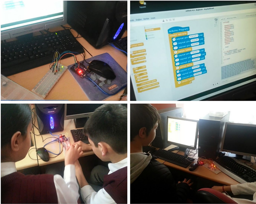
Fig. 3 Images from the application process

The scale includes a dimension for Learning Desire, which aims to uncover students' curiosity and interest in robotics with items such as "I want to learn more about robotics" and "robotics interests me." In the Confidence dimension, items like "I believe I can become an expert in the field of robotics" and "I can build a robot" are designed to assess students' belief in their ability to build and program robots. The Computational Thinking dimension includes items such as "I am good at logical thinking" and "I solve problems in a logical way" to reveal students' approaches