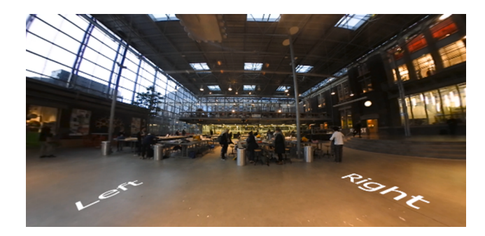
Fig. 4. Screenshots of the Validation scenario.

Besides the four scenarios, a general familiarisation scenario was developed to allow participants to become familiar with the way to observe the virtual environment and the sensation of VR. The familiarisation scenario entailed a 360° video of the workshop space, and it excluded any evacuation clues, evacuation alarm, or any pedestrians. In order to help participants to describe their exit choice, "Left" and "Right" signs were added on the ground of all scenarios (Fig. 4). The participants did not have a visible presence in the virtual environment (i. e., a participant cannot see their own body).