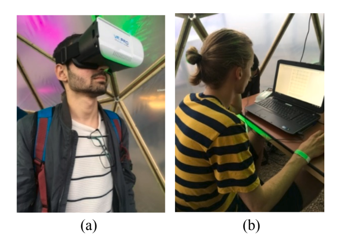
Fig. 7. Participants were (a) experiencing the VR experiment and (b) filling in the questionnaire.

In the Validation scenario from the VR experiment, 27 individuals participated. One participant did not make the exit choice before the experiment ended, thus the results of the Validation scenario discussed underneath are based on 26 participants including 10 females (48%) and 16 males (52%). The ratio of the distribution of gender of the participants between the field experiment and VR experiment was not significantly different (p = 0.204).