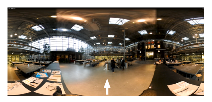
Fig. 3. A screenshot of 360^\circ view of the workshop space by the Nikon 360 Camera.

A combination of normal cameras and 360 cameras was used, namely two 360° cameras (i.e., Nikon KeyMission 360 Camera and Kodak Pixpro SP360 4 K Camera) and three normal cameras (i.e., Car-CamDoo camera). Their positions in the workshop space are identified by icons in Fig. 1. Two of the three 'normal' cameras were placed at the second level of the workshop space, and the third one was placed on a balcony overseeing the workshop space (Fig. 2). These normal cameras had a higher and wider view, which ensured capturing the evacuation process of each individual. In order to identify every person clearly, the two 360 cameras were placed at the height of 1.8 m above the ground to capture the overall movement of the participants from an aerial view (Fig. 3). The setup of the field experiment ensured the behaviour of all students could easily be observed throughout the whole evacuation process without the observation being invaded or disturbing their