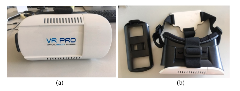
Fig. 6. The front view (a) and the top view (b) of the head-mounted display was used during the VR experiment.

experiment and the actual exit choice of each participant.