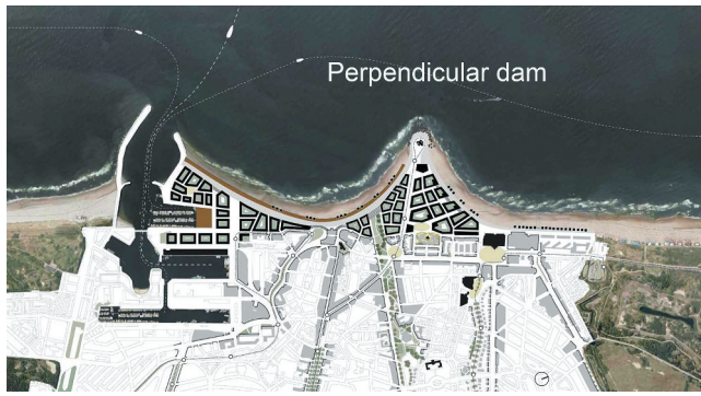
Figure 6. Scenario 'City in the sea', in which the urban fabric slowly grows seawards around a perpendicular dam where sedimentation takes place and building land emerges.