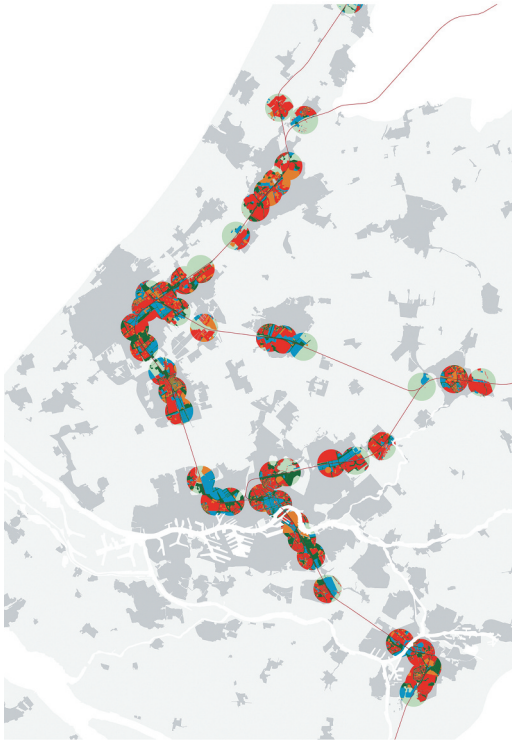
Figure 4. The 47 stations in the Zuidvleugel: a regional network projected to accommodate a growth in housing, offices and other facilities, making transit oriented development a feasible option.