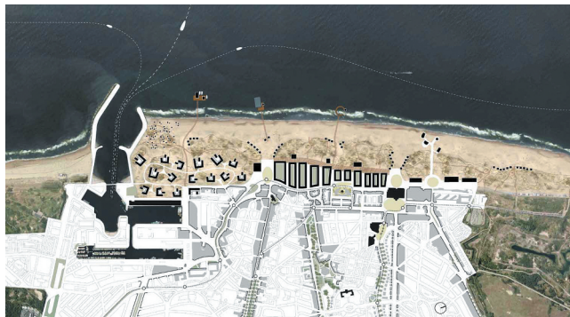
Figure 8. (right): Scenario 'Soft seaward' works with a new stretch of dunes that creates a natural environment for a more nature-sensitive form of development.