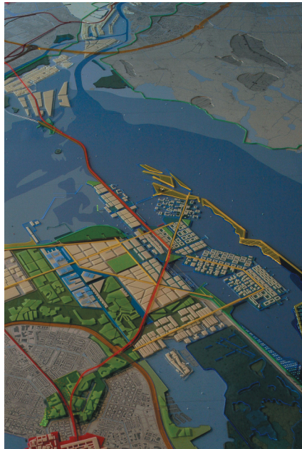
Figure 3. Final model showing the new urban districts along the shoreline and on reclaimed islands in the IJmeer, connected to Amsterdam by new bridge. Source: Atelier IJmeer (2006), photograph by Hans Werlemann.

accessibility of the new districts, was completed and published in the book Atelier IJmeer 2030+ (Koolhaas, Marcusse, and Staal 2006). The results showed possible futures for the development of the newtown of Almere, creating a range of ideas for the development of new urban districts that could thrive due to the new bridge connecting it directly to the Dutch capital Amsterdam (Figure 3). The designs had no formal status, but found their way into planning documents and urbanist plans.