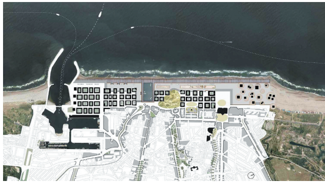
Figure 7. (left): Scenario 'Hard seaward' projects the water barrier on the edge of land and sea, which makes it possible to build new urban fabric behind it.