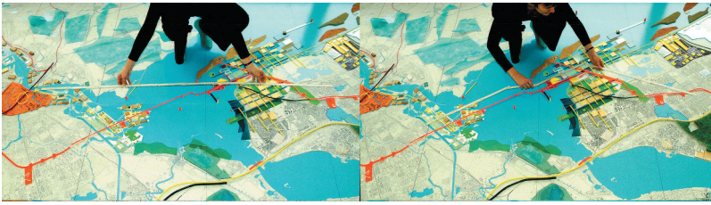
Figure 2. Working with the large models developed during the atelier sessions. The models were used to try out different scenarios of how to add new urban districts to Almere in combination with a new public transport link to Amsterdam.

accessibility of the new districts, was completed and published in the book Atelier IJmeer 2030+ (Koolhaas, Marcusse, and Staal 2006). The results showed possible futures for the development of the newtown of Almere, creating a range of ideas for the development of new urban districts that could thrive due to the new bridge connecting it directly to the Dutch capital Amsterdam (Figure 3). The designs had no formal status, but found their way into planning documents and urbanist plans.