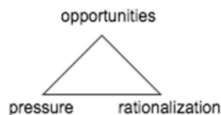
Figure 1. Fraud triangle [1, 9]

The word ‘corruption’ is based on Latin: corrumpere means to spoil or destroy. Corruption is defined as “behavior which deviates from the normal duties of a public role because of private-regarding (family, close private clique) pecuniary or status gains” [21] (p. 4). An additional aspect of corruption in the case of government, is the misuse of power [12]. So similar to the notion of fraud, which is defined as a violation of trust [9], corruption involves the misuse of responsibilities related to a public role or duty. For instance, corruption involves “bribery (use of reward to pervert the judgments of a person in a position of trust), nepotism (bestowal of patronage because of ascriptive relationship rather than merit), and misappropriation (illegal appropriation of public resources for private-regarding uses)” [21] (p. 4).