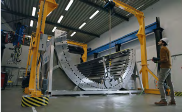
Figure 7: An automated manufactured lower shell of the fuselage of the future

procedures and flight control algorithms can be tested with our aircraft. All algorithms are first tested in our full-motion flight simulator, Simona. Finally, swarm and automation technologies of ground-based and flying uninhabited vehicles can be investigated in the 10 by 10 metre "cyber zoo".