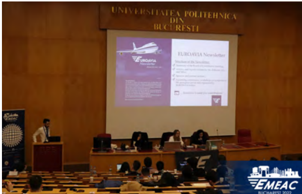
Figure 1: Electoral Meeting of the EUROAVIA Congress (EMEAC) held in Bucharest (Romania) in March 2022. First physical event after two years of pandemic