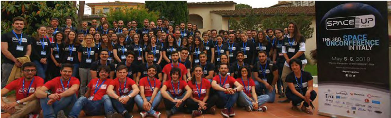
Figure 3: Space Up (Symposium), Pisa (Italy). May 2018