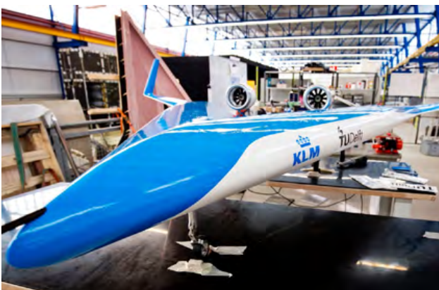
Figure 5: The Flying V, a fuel-efficient aircraft configuration

city-driven research that generates blue sky ideas and challenge-driven research that tackles the very complex problems that society and industry are facing today and tomorrow. The current Dean of aerospace engineering, professor Henri Werij, made it unambiguously clear in this inaugural address as a TU Delft professor already in 2018: "We have to start the clear sky revolution". The four areas that Delft aerospace has identified for climate neutral flight are a reduction of energy consumption of flying vehicles, sustainable energy generation and consumption, sustainable aviation operations and minimisation of the environmental impact of materials and structures.