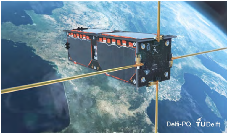
Figure 4: A pocket cube satellite of TU Delft in orbit

city-driven research that generates blue sky ideas and challenge-driven research that tackles the very complex problems that society and industry are facing today and tomorrow. The current Dean of aerospace engineering, professor Henri Werij, made it unambiguously clear in this inaugural address as a TU Delft professor already in 2018: "We have to start the clear sky revolution". The four areas that Delft aerospace has identified for climate neutral flight are a reduction of energy consumption of flying vehicles, sustainable energy generation and consumption, sustainable aviation operations and minimisation of the environmental impact of materials and structures.