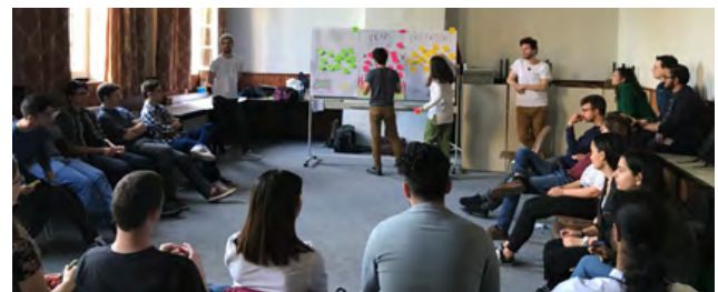
Figure 4: Train new trainers held in Leuven (Belgium). March 2019

During this event, participants from different European universities will have 24 hours to propose a solution to the challenge chosen and proposed by the companies collaborating within the competition. The solution achieved will be evaluated by taking into consideration several criteria, such as its business and technological feasibility among others. This project is being held in collaboration with Knowledge Innovation Market (KIM) Barcelona after a first online edition that proved to be successful.