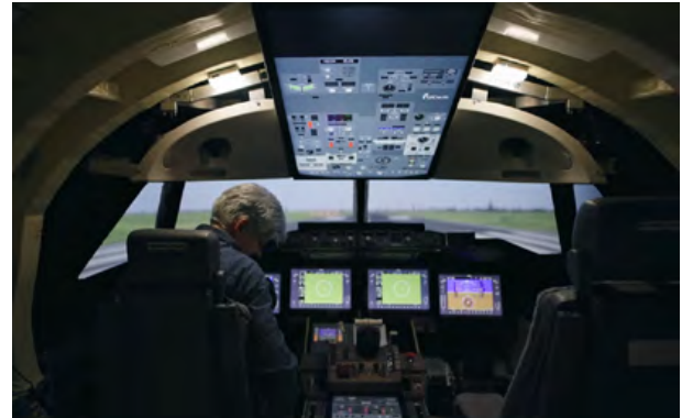
Figure 8: The full-motion research simulator SIMONA

The cornerstone of the high-quality education and research is (inter)national collaboration, one of the strong points of the faculty. The trinity between education, research and collaboration is embodied in the Aerospace Innovation Hub @TU Delft. The Innovation Hub is hosted in the aerospace engineering faculty building. The hub offers a vast aerospace network and a rich talent pool. Academia, start-up companies, often university spin-offs, and industry meet to collaboratively tackle the societal challenges in space and aeronautics. Another concrete collaborative story is Flying Vision. This concept is both a holistic vision of climate-neutral aviation by 2050 and a physical meeting place on the TU Delft campus that will be opened in 2022. Flying Vision was signed by the CEOs/chairpersons of Airbus, KLM, Schiphol Airport,