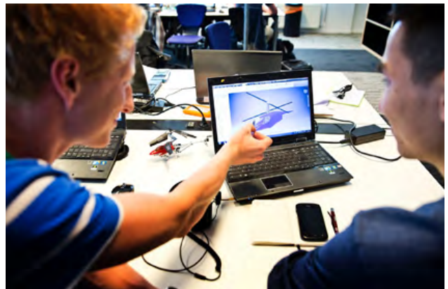
Figure 2: BSc students designing a new air vehicle

rial sciences, statics and dynamics. But just gaining knowledge is not sufficient to be successful. TU Delft aerospace engineering invests a lot of effort in bringing the theory from the lecture rooms to life. This is done by teaching concrete aerospace courses from day one and applying the theory in student projects. Students already learn in the first week of the curriculum why a wing has a sweep angle or not. By the end of the first year, they have already built and tested their first own-designed aluminium wing box. They have to drill, cut, saw, debur and assemble all components themselves in a project team of around ten students.