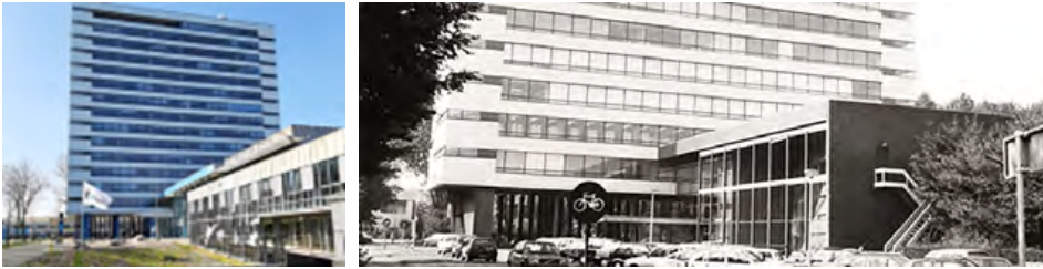
Figure 1: The faculty today - The faculty in the old days