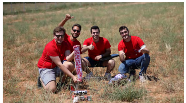
Figure 2: Rocket Workshop held in Valencia (Spain) in Summer of 2018

The Air Cargo Challenge (ACC) is the biggest project in which EUROAVIA collaborates, with more than 300 participants from all over the world. The next edition will happen in summer 2022 in Munich.