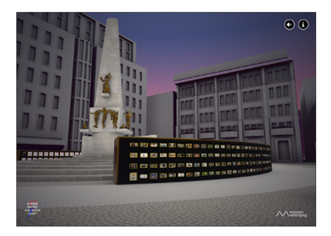
Tissen Journal of Conservation and Museum Studies DOI: 10.5334/jcms.207