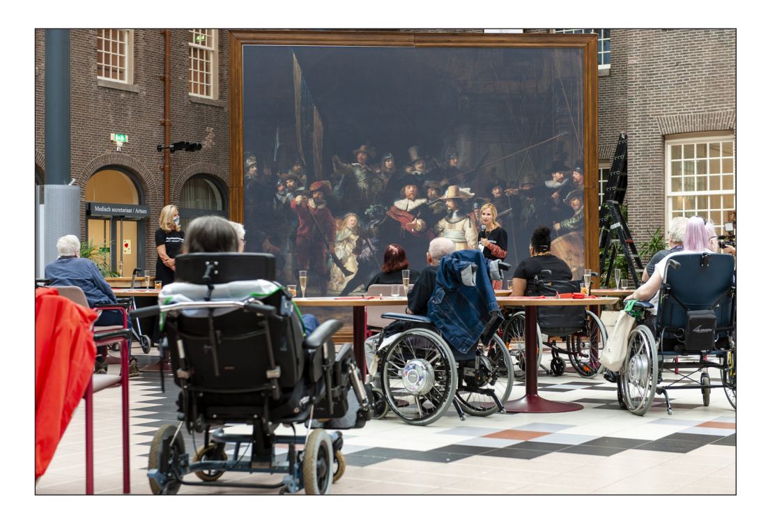
Figure 1 Nachtwacht on tour. Image by Janiek Dam.