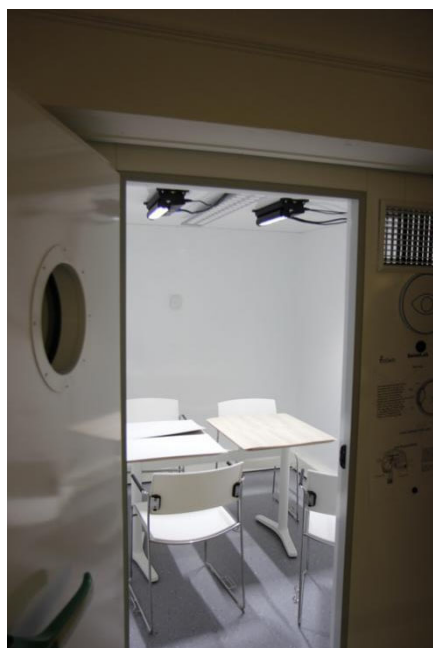
Figure 1. The light test chamber set-up.

each other and next to each other. Two desks on one side were labelled A, and the other two, B.