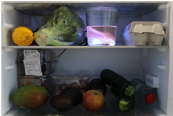
Figure 2: The first iteration of the prototypes was designed for short movies to depict and explore the fictional scenarios. In that first iteration, we controlled the light manually to simulate the interaction with a conversational agent.

The electronics were designed to simulate the interaction with a conversational agent with sound and light (Figure 3). When people open the lid, the light and sound play. That encourages people to get closer to the jars to listen to the conversation, which in turn invites them to have a closer look at the living-like creature and sense the smell, which makes the experience stronger. People are encouraged to open the lids by mimicking other visitors and by simple messages written on the table/tiles that state "Open the lid." At the same time,