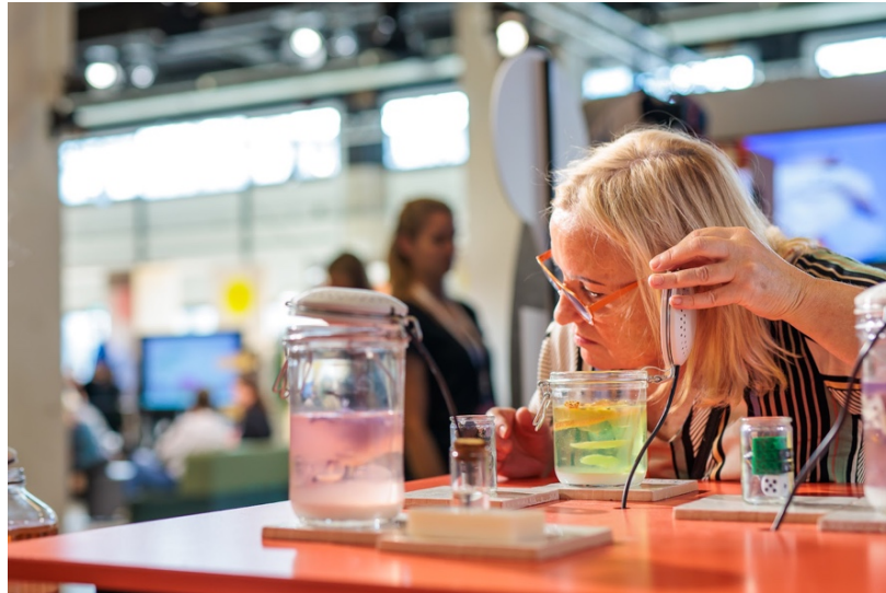
Figure 1: Conversation Starters is a series of prototypes that explore how to design explainable interactions with AI. By opening the lids, visitors can listen to the fictional agent and smell the organisms growing in the jars.

need to be better situated [4, 12, 14]. While interactive approaches have emerged in Explainable AI [20] not much attention has been paid to conversational approaches for explanations [10] nor to the active role that users and agents have in those processes [14].