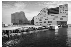
Oosterdokseiland & Courthouse