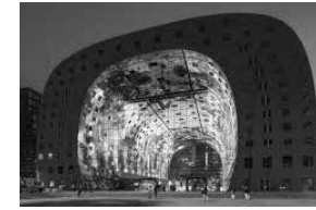
The Market Hall