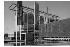
The New Institute