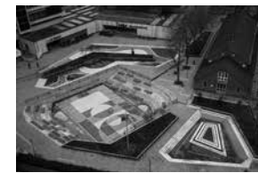
Water Square Rotterdam Bentheplein