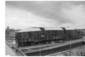
Station Building Delft