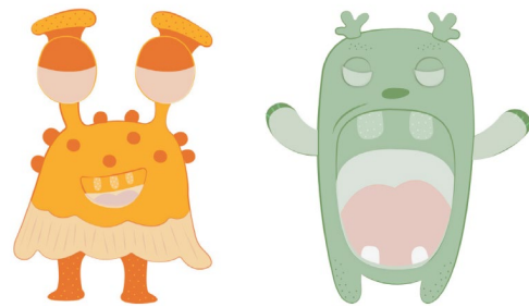
Figure 6. Graphic designs for two monster plates by Hannah Goss.