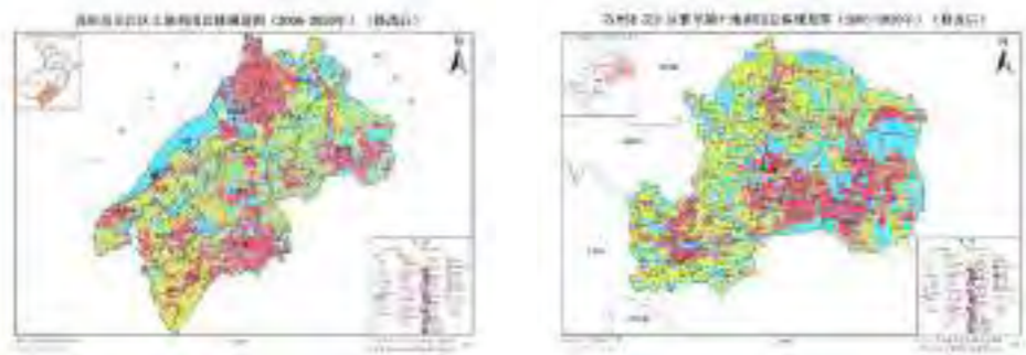
Figure 3 Land use planning of Wujiang District and Lili Town, Suzhou, Jiangsu Province (red spots are planned building sites)

region with rapid development, intensive land, and vertical and horizontal water systems, the problem of collaborative governance for ecological goals is particularly prominent and acute, which is a very typical cross-border regional space.