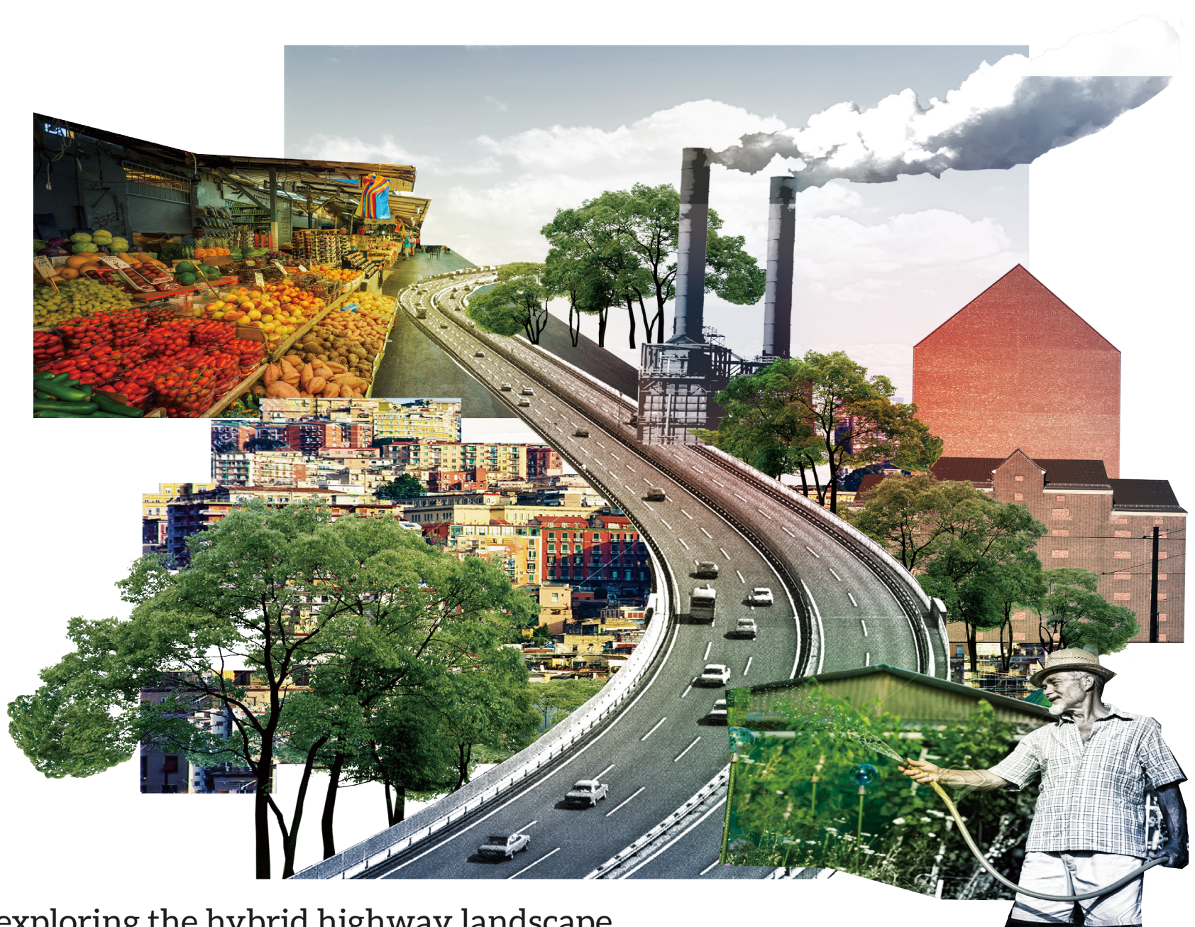
exploring the hybrid highway landscape