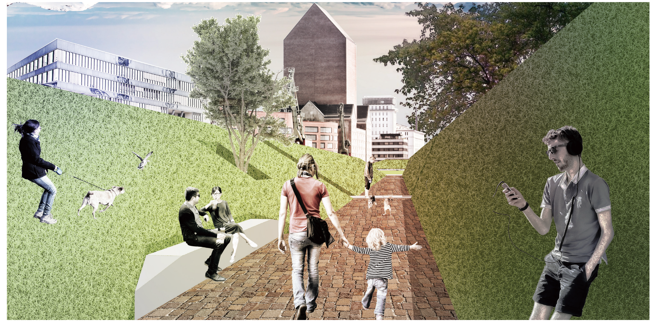
Playing along the highway sheltered by the noise barrier