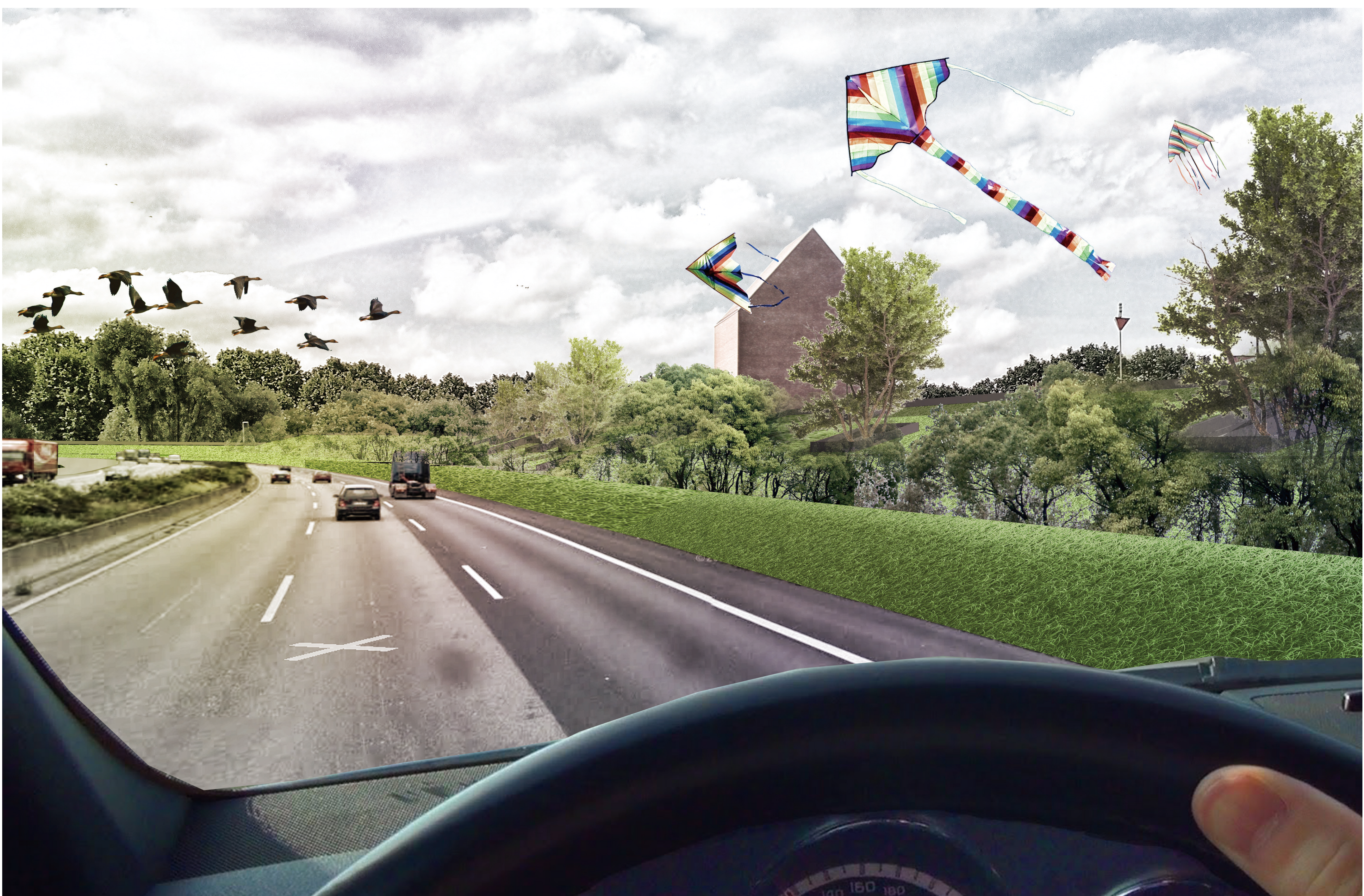
The monotonous and unattractive scenic has been replaced by an active urban image including landmark.

Urban highway, as a product of modern city, is one of the most important influencing factors that shape the contemporary urban landscape. It was built to ease the urban traffic pressure. However, the negative impacts on the urban space and the surrounding environment cannot be ignored. In the most cases, highway is widely regarded and treated as an only functional infrastructure. In my point of view, it also has potentials to be a public facility instead of strictly utilitarian by being contextualized, integrated and interacted with urban environment and urban life. Therefore, I have developed a concept of 'hybrid highway landscape' as a new phase of urban highway. In order to explore the potential of hybrid highway landscape, highway A40 in the centre of Duisburg, a highly urban context, and its right-of-way is regarded as an interesting experimental field for the research project.