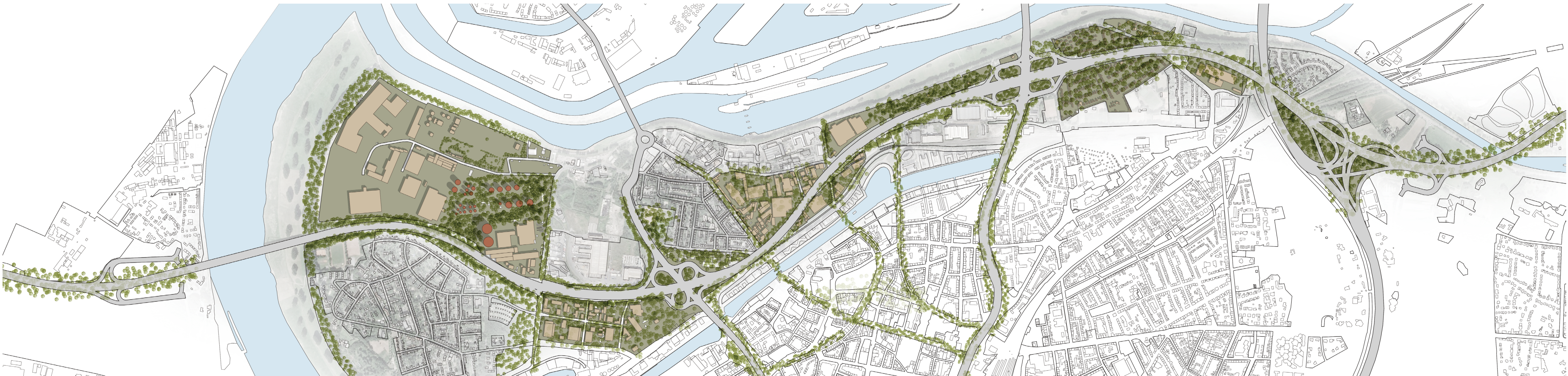
Transforming the isolated highway line into an integral zone with urban environmental