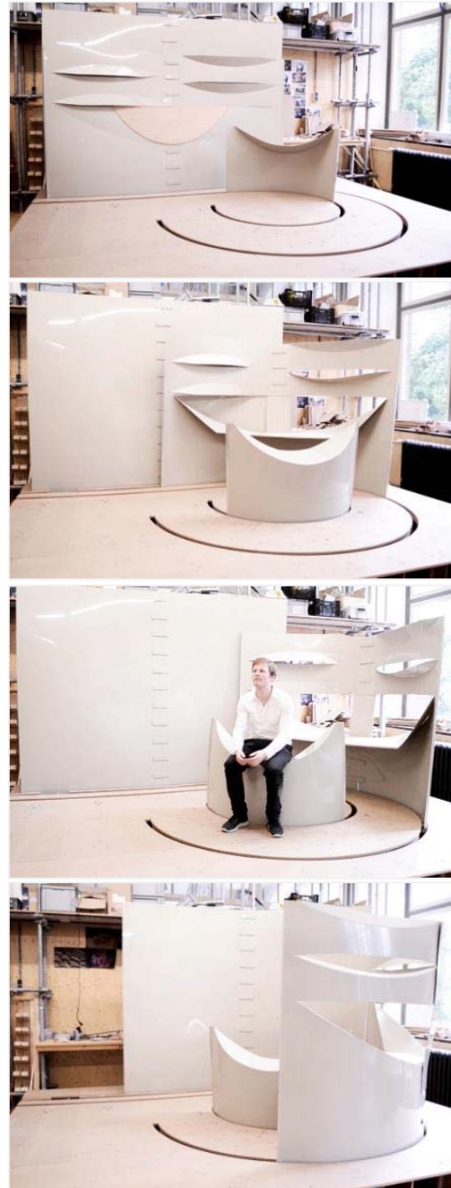
Figure 2: Reconfigurable apartment developed with MSc 2 students and industry partners at Hyperbody , TU Delft (Pop-up Apartment, 2013)[6]

In this context, sensor-actuated environments are not only customisable in order to provide healthier ambiance, but they may also offer solutions for managing the demands associated with rapid population growth, urban densification, and the contemporary inefficient use of built space by enabling multiple, changing uses within reduced timeframes.