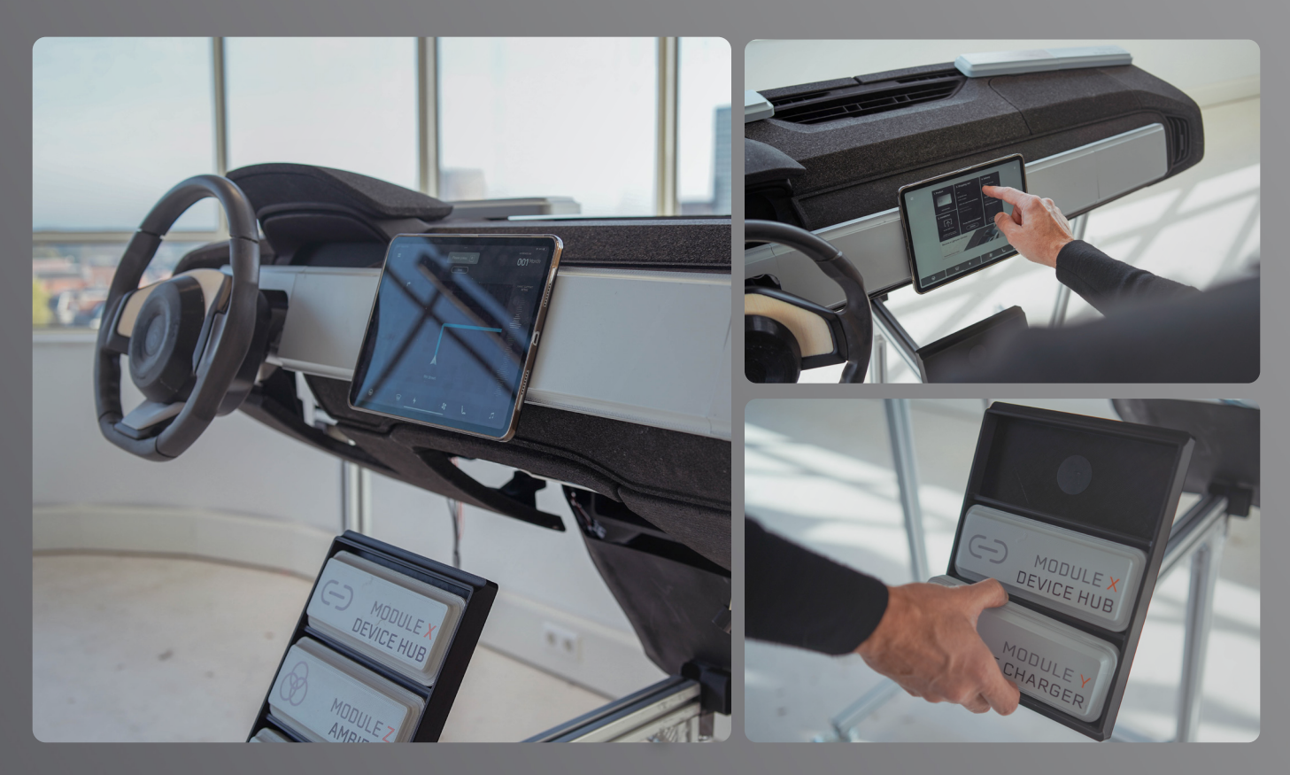
Functional prototype used for user tests to evaluate both digital and physical design

Several digital in-car interface mock ups, scan QR below to discover it through an interactive prototype