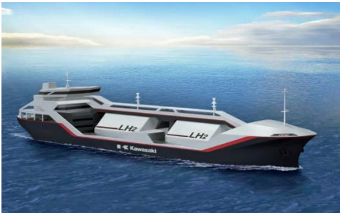
Figure 1.1: Artist impression of the world's first liquefied hydrogen carrier, the Suiso Frontier, (actually launched December 2019).

We illustrate this by the example of port adaptation to hydrogen transport ( Figure 1.1 ; also see Lanphen, 2019 ). Hydrogen is expected to become an important carrier of clean and renewable energy and port authorities are already considering what role they wish to play in the hydrogen supply chain.