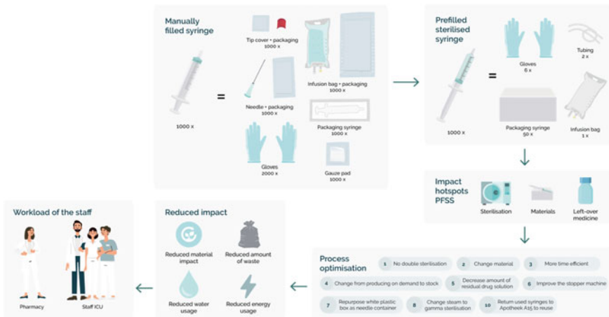
Fig. 2 Visualization of the conclusion of the project

In conclusion, this study showed how the environmental impact of syringes can be reduced. Replacing manually filled syringes with PFSs saves additional products, and thus saves waste (see Fig. 2). However, the PFSs come with new significant impact hotspots, such as double sterilisation, materials used and left-over medicine. The impact of these hotspots is decreased by the final design, a process optimisation of the PFSs. In the end, the optimised process reduces the amount of waste, energy and water usage and material impact per syringe.