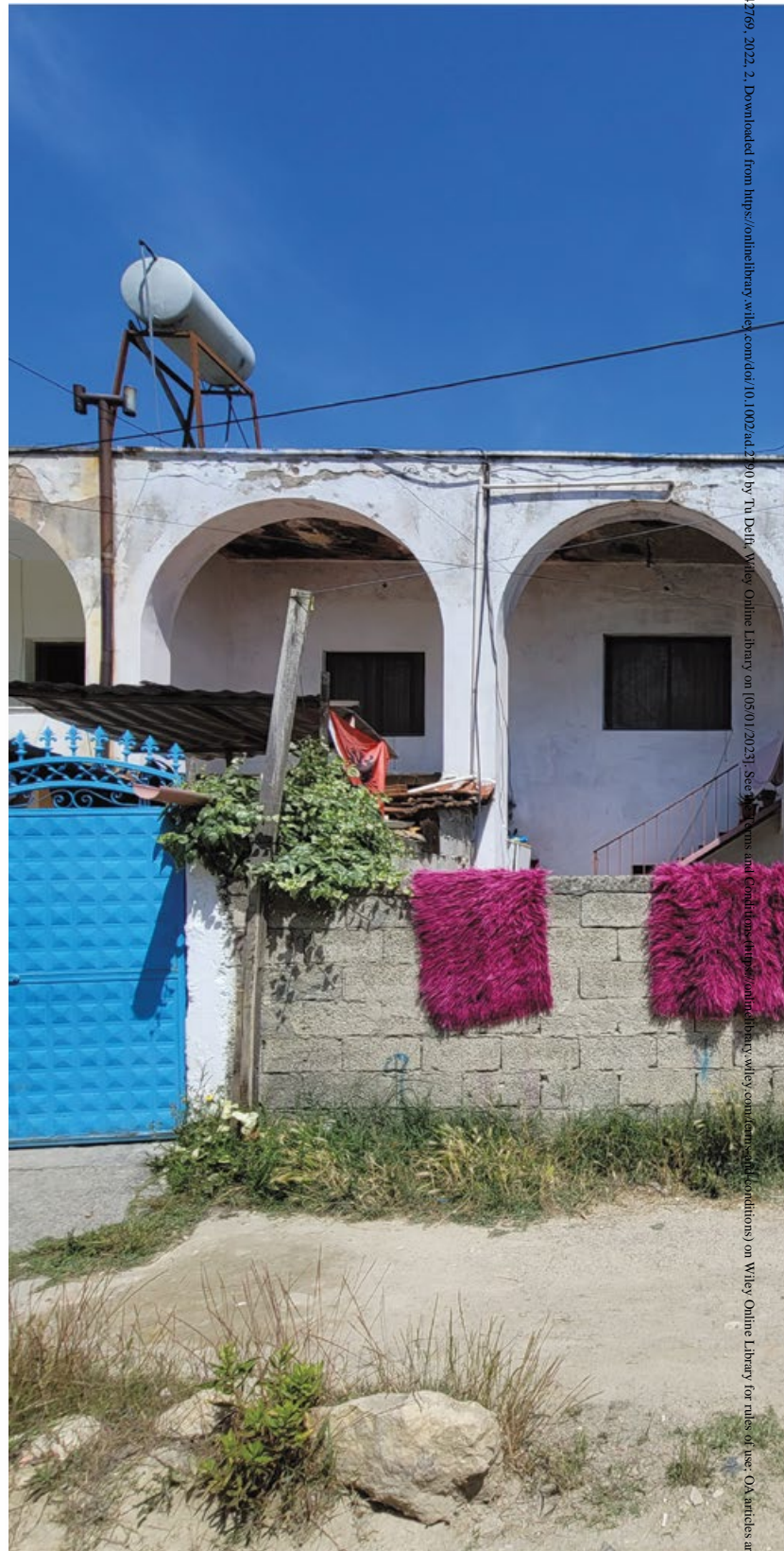
Kombinat, Tirana, photographed in November 2019 and June 2021

The statue of Stalin stood in the main square of Kombinat, which was considered a model working-class neighbourhood by the Communist state, embodying the transition from an agrarian to an industrial Albania. 2