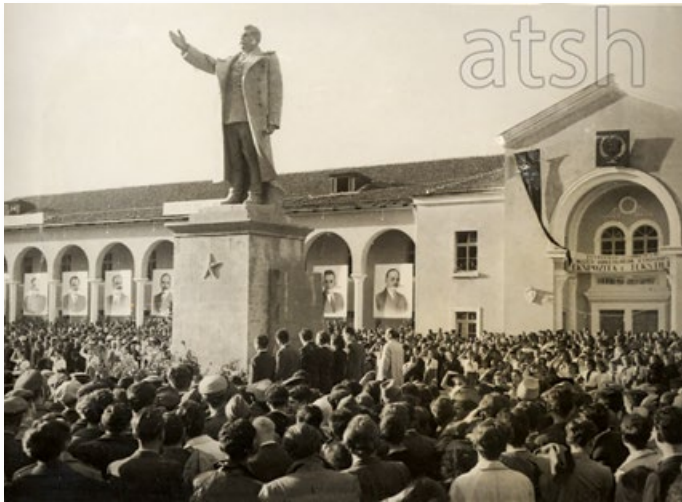
Inauguration day, Stalin Textile Factory ('Kombinat'), Tirana, 8 November 1951

With the fall of the totalitarian regime in 1991, production stopped and the machinery and mills were abandoned. Demographic allocations of the population were no longer centrally controlled as they had been under the previous regime. This triggered a flux of migration towards the capital city from remote areas of the country as people sought better life opportunities. These migrants in need of housing discovered the cold and enormous industrial structures of Kombinat. Once vibrant and the objects of pride, these buildings now stood in a state of depression, surprisingly stoic and simultaneously inviting. They were seen as a place of refuge, a roof over one's head, with no comfortable rooms, no heat, but just an opportunity for shelter in anarchic times when the state was absent. They