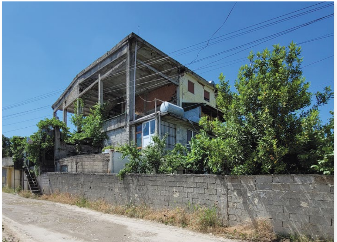
Kombinat, Tirana, photographed in November 2019 and June 2021

above: Architectural entanglements of the large-scale industrial buildings with the small-scale interventions by those who have taken up residence in them.