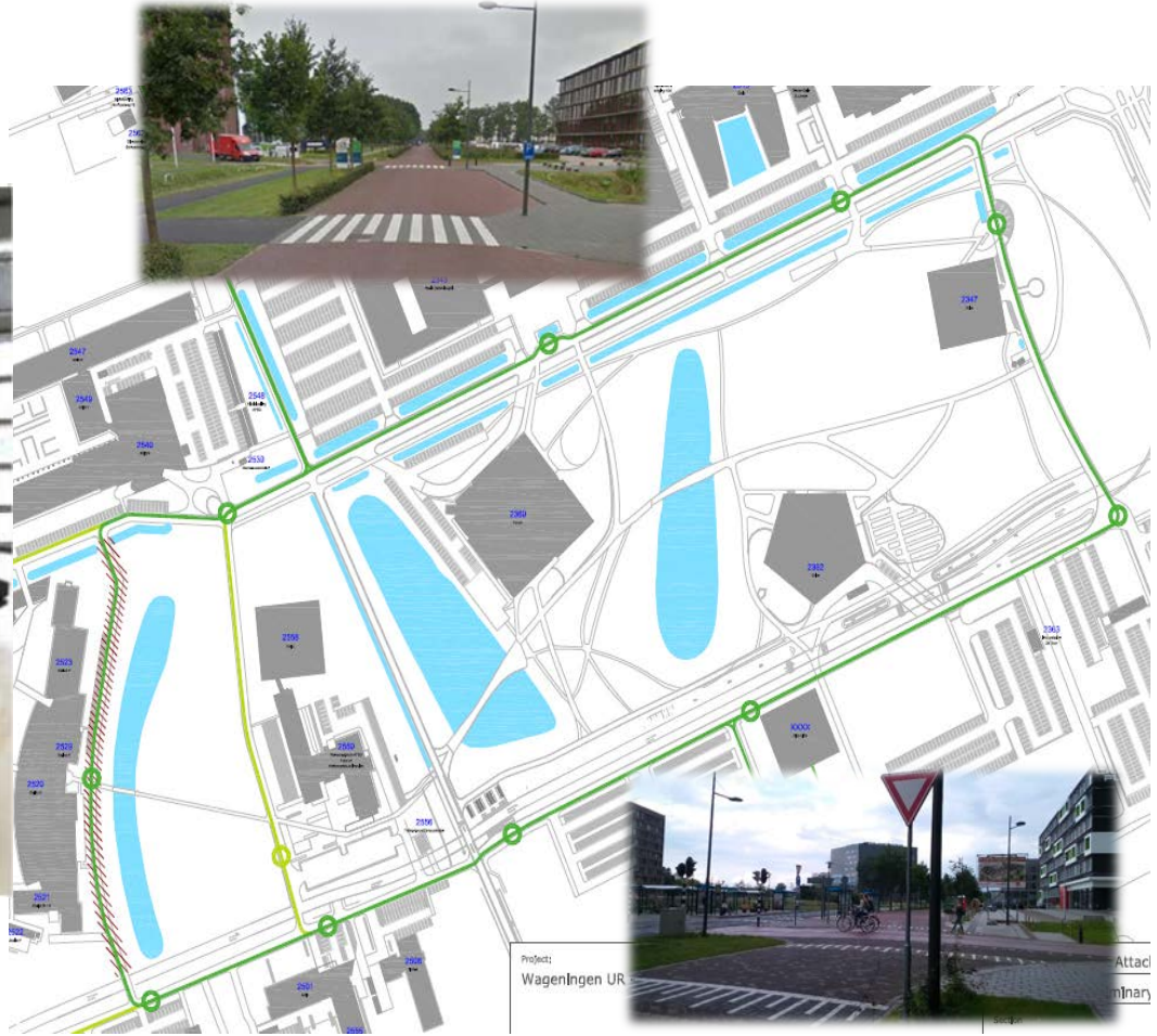
Project: WagenIngen UR