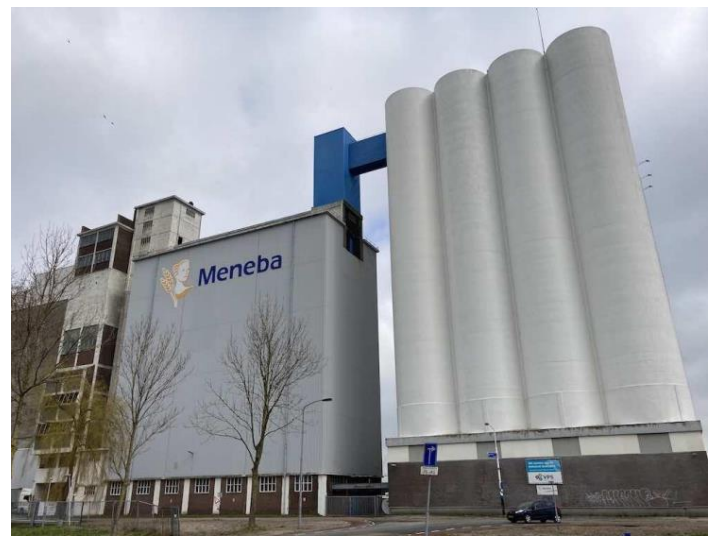
Figure 4: The silos from the research of Geerts (2021).

SAENZ is not only responsible for the collective purchasing of energy for (part of) its members, they also help their members with applying for subsidies. An added benefit is that through SAENZ, members are able to get higher subsidies than when they would apply for the same ones by themselves. This is for example the case for the subsidy for PV-panels. In the municipality of Zaanstad businesses receive \pounds 25 per PV-panel when applying as a single business, but \pounds 50 per PV-panel when applying with a group of businesses (Gemeente Zaanstad, 2024).