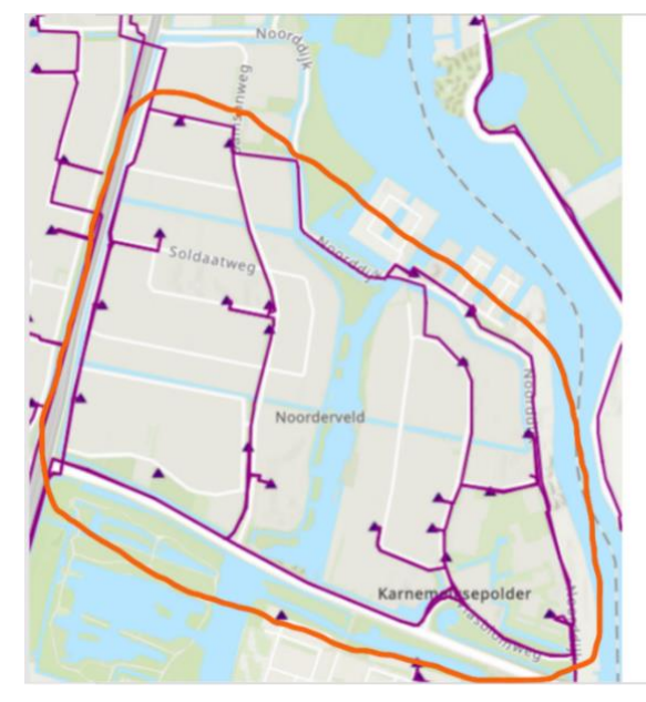
Figure 5: Location of string 2 (the purple cable within the orange circle) (adapted from Liander, 2023).