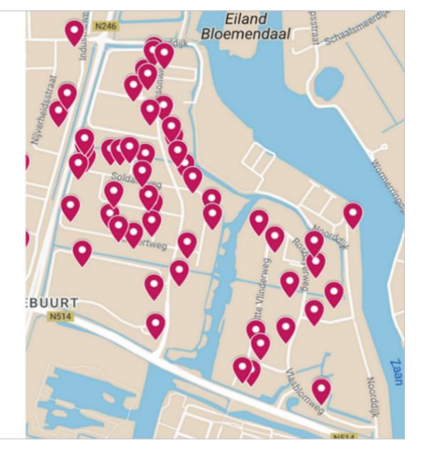
Figure 6: Location of SAENZ members in the area of string 2 (Broeder, 2024).