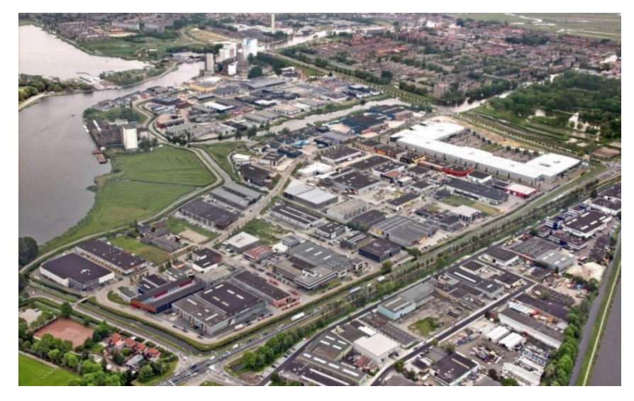
Figure 3: Bird view of Businesspark Wormerveer.

To shape this research, a case was selected within the municipality of Zaanstad. This municipality is located in the North-West of the Netherlands in the province North-Holland and has 159.618 inhabitants (CBS, 2024). The case is business energy cooperative SAENZ which considers the interests of all businesses in Zaanstad-Noord (Businesspark Wormerveer (Figure 3) and ABIN), Zaanstad-Zuid (OVZZ) and Wormerland (BVW) (SAENZ, 2023c). In total 118 businesses are members of SAENZ and 82 of these are located on Businesspark Wormerveer. The industries these businesses work in differ from transport to food and from marketing to woodworking and many more (SAENZ, 2024c). Thus, the businesses are quite different from each other.