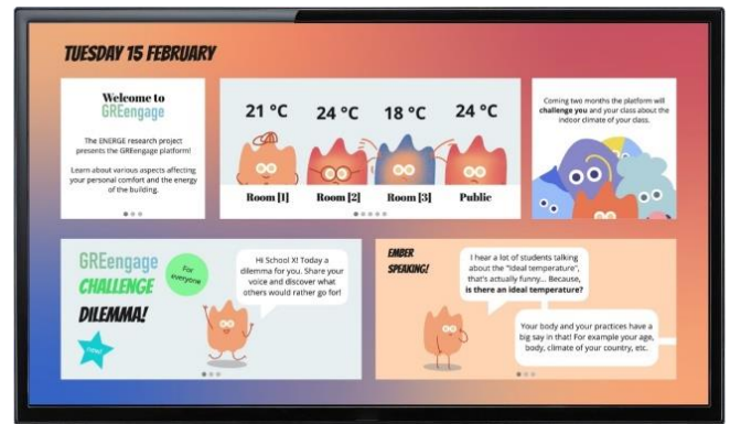
Fig. 2 - ENERGE Digital Platform mock-up

The role of the ENERGE Digital Platform (Fig. 2) in building learning communities is clear. By using this tool, students, teachers and other stakeholders were able to collaboratively analyse data on the built environment, execute exercises in modelling and make certain decisions on the basis of the obtained energy/comfort data. It may serve as a learning lab for members of the ENERGE Committees, the Teacher Network and all other interested stakeholders. A “learning lab” metaphor here means that the interested persons could understand the essence of various parameters of their built environment, identify interdependences about these parameters and potentially be more driven to address challenges related to their environment. Of course, the ENERGE Digital Platform can also assist in energy management of the project schools, by acting as a tool for monitoring and displaying energy efficiency and changes in behaviour.