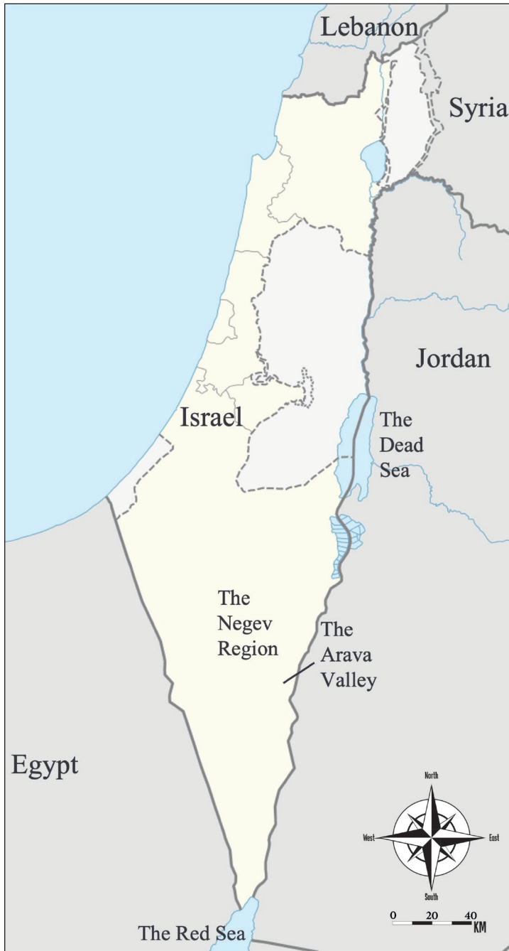
Figure 1: The Arava in the Negev region in Israel (map by NordNordWest, Ynhockey, adapted from Wikimedia)