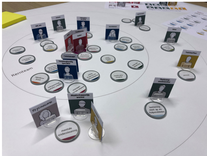
Figure 2 Co-design tool for the layer Companions, with an inner circle including the patient and his/her significant other at the centre and the other people involved on a regular basis, and an outer circle with people who may ad hoc be drawn in, for example, a dietitian, a psychologist.