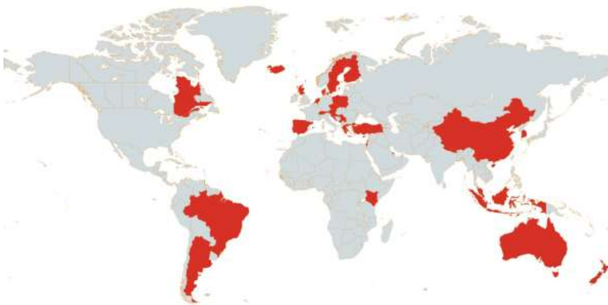
Figure 1. Spatial distribution per continent of the countries that have participated in the 4 th Questionnaire of 3D Land Administration (current status of 2022 and expectations for 2026).

At the following figure, the spatial distribution of the countries that have participated in the 4 th Questionnaire on 3D Land Administration is presented.