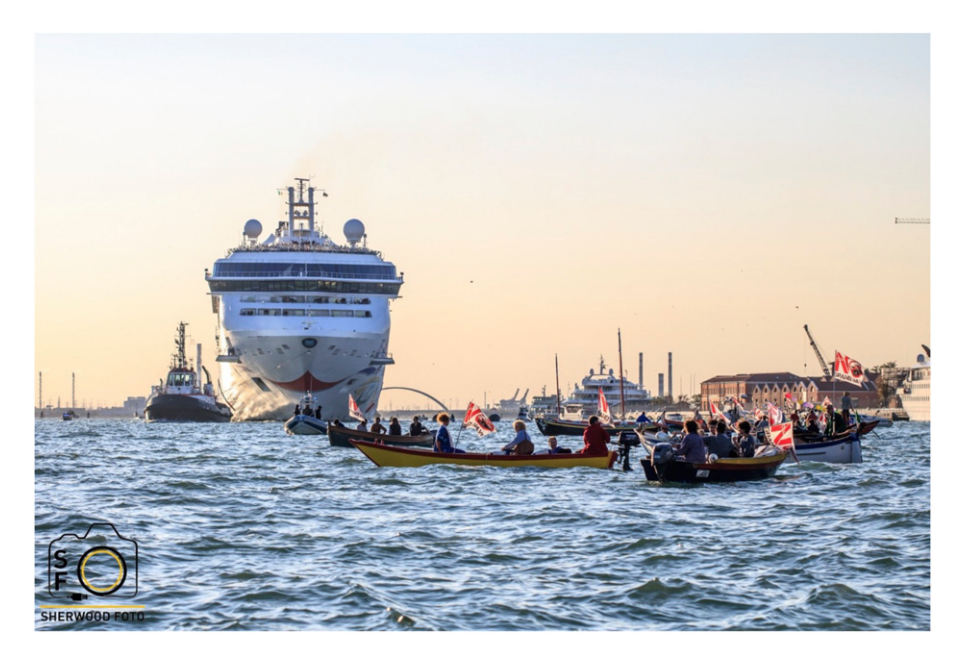
Figure 4. A blockade against a cruise ship on 30/9/2018.

The committee's dynamism also sparked different forms of knowledge production that has provided the critical discourse of the committee with solid arguments, including scientific back-up.