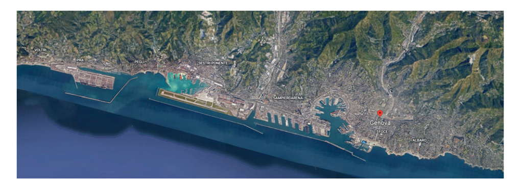
Figure 1. Satellite image of the western coastal side of Genoa. Google Earth, captured in 22/3/2021.

Despite the actions led by the foundation being initially labelled as "parochialism" at the port authority and city hall, PRimA'vera managed to open a channel of communication between in-habitants and the port and the central administration of the city. The foundation has not only triggered institutions to make emblematic decisions, such as changing the terminal's name from Voltri to Pra', but it has also enacted processes of participation through several initiatives. Public, collective discussions within the local inhabitants were turned by the foundation into technical proposals – discussed later with port and city institutions as well as with port stakeholders including PSA, through a series of roundtable events called Pra' Palmarium . As a result of this process, the urban plan of the port was altered, incorporating solutions for mitigating the impacts. Some solutions were co-designed by the students of Pra' together with the University of Genoa. Green