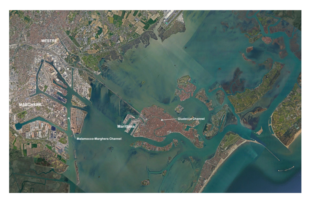
Figure 3. Satellite view of city and port of Venice. Google Earth, captured in 22/3/2021.

such as the congestion and jeopardization of local identity (Gutberlet, 2019), Airbnb-driven increases of house prices and gentrification, with the expulsion of residents towards the periphery (Chamizo-Nieto et al., 2023), and 'McDonaldized tourism' that standardizes products and experiences (Ritzer and Liska, 1997).