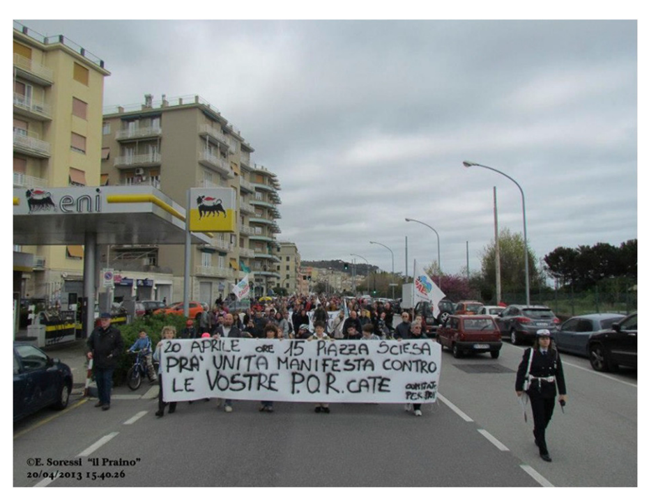
Figure 2. Residents of Pra' marching against the port-driven urban plan of the western side of Genoa on 20th March 2013.

barriers, new public spaces and a small marina have been proposed as ways to separate the port from the residential area, allowing inhabitants to regain access to the water. Funding for implementing the solution has been recently obtained by the European Commission and the Italian Ministry of Infrastructure and the interventions will finally go ahead. The president of the foundation described this evolution as "obtaining respect from institutions and bringing back self-confidence and pride to the citizens of Pra".<sup>3</sup> However, the public participation process was limited at both geographical and political scales. The participatory process involved residents of Pra' through the foundation, and the port and city institutions, without engaging other neighborhoods along the western littoral also affected by port activity. This resulted in the negotiation of impact mitigation solutions only for the waterfront of Pra', rather than a larger debate of the port-city relationship.