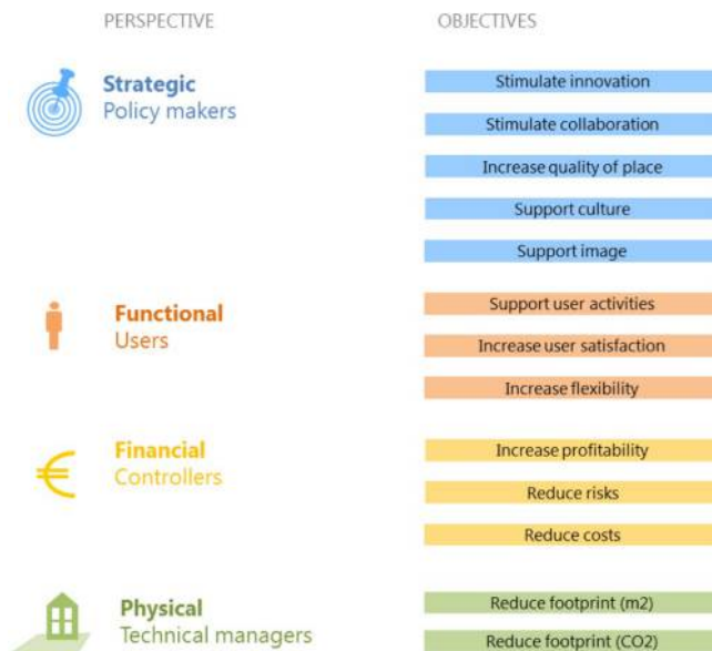
Figure 1. Objectives per stakeholder perspective to add value to the campus

In her dissertation on managing the university campus, Den Heijer (2011, p. 245) developed a model to assess the added value of real estate decisions, from project to performance. This model is based on evolving insights on the stakeholder perspectives to connect in CREM and the different aspects in which value can be added by real estate. Figure 1 shows an adaptation of the model, which is used to position the reasons to implement a smart tool, also in the survey and interviews with universities. The use of this model is used to assess which objectives are achieved both directly and indirectly.