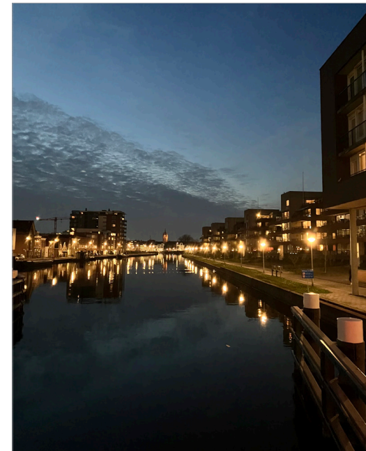
Fig. 3. Nearing the end of our walk we cross Abtswoudsebrug and wave good night to the crooked belfry of Old Jan.