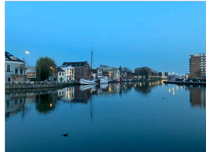
Fig. 2. The expanse of the Schie and the horizon in the evening.

The impressive building of Huszár protects our embraces from a distance, knowing we will be walking by its side in a few minutes, and then immediately finding ourselves at the Vermeer spot. This is where Vermeer painted his famous View of Delft . A contemporary public art installation commemorates the historic location but falls short in communicating the power of the view itself, even more of the painting. So do the garbage and recycling bins besides the location marker. Behind the installation lies an open green