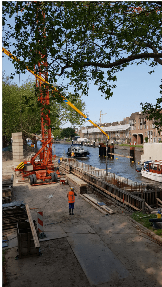
Fig. 4. 'In Delft, 3 March 2020'.

field where Caldonia runs around, unless the weather is too wet or cold. This is our last stop along the way. Soon we find ourselves on the other side of Abtswoudsebrug, where we first met the Schie. Crossing it signals our goodnight to the city, the water, the outdoors. The crooked belfry of Old Jan responds to our waves, or so we want to believe (Fig. 3). The sound of the door locking behind us ends our evening walks. Caldonia discreetly curls up in her bed and soon starts whistle snoring in her unique way. Whether she dreams of the smells 'around the Schie' or her beloved Louisiana back home, is something we will never really know.