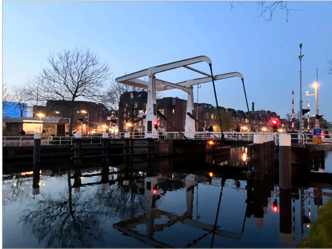
Fig. 1. We cross the water over Hambrug.

We turn with the canal and head straight, cross the water over Hambrug (Fig. 1), where Caldonia sometimes stops to look at the ducks gathered around the old steel structure.