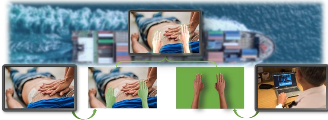
Figure 1: Two-way AR service concept in marine medical care