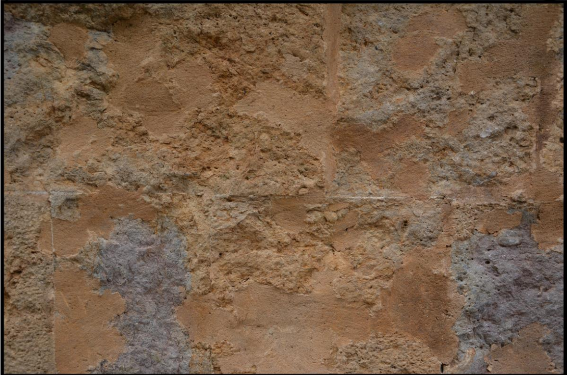
Figure 8: Mortar repair carried out on multi-coloured degraded sandstone blocks. The mortar