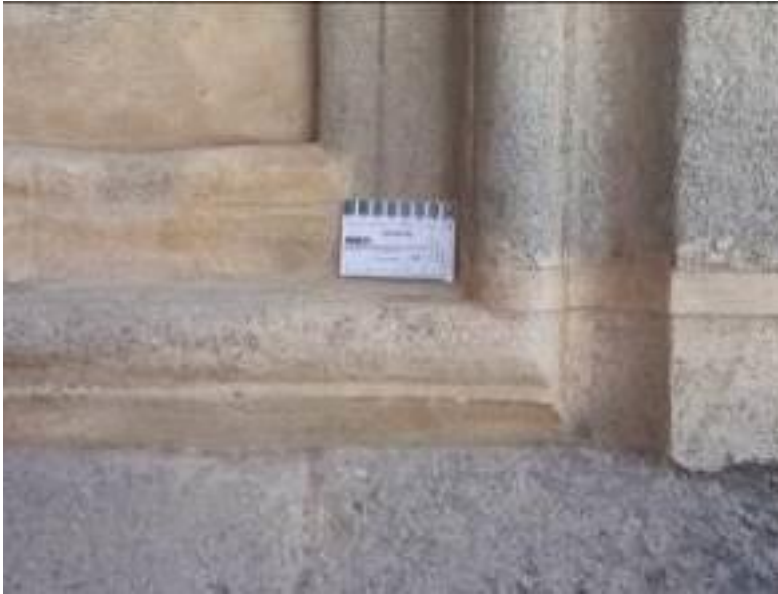
Figure 3: Mortar used to repair deteriorated stone parts and detailing of the main entrance portal of the cathedral in Évora, Portugal.