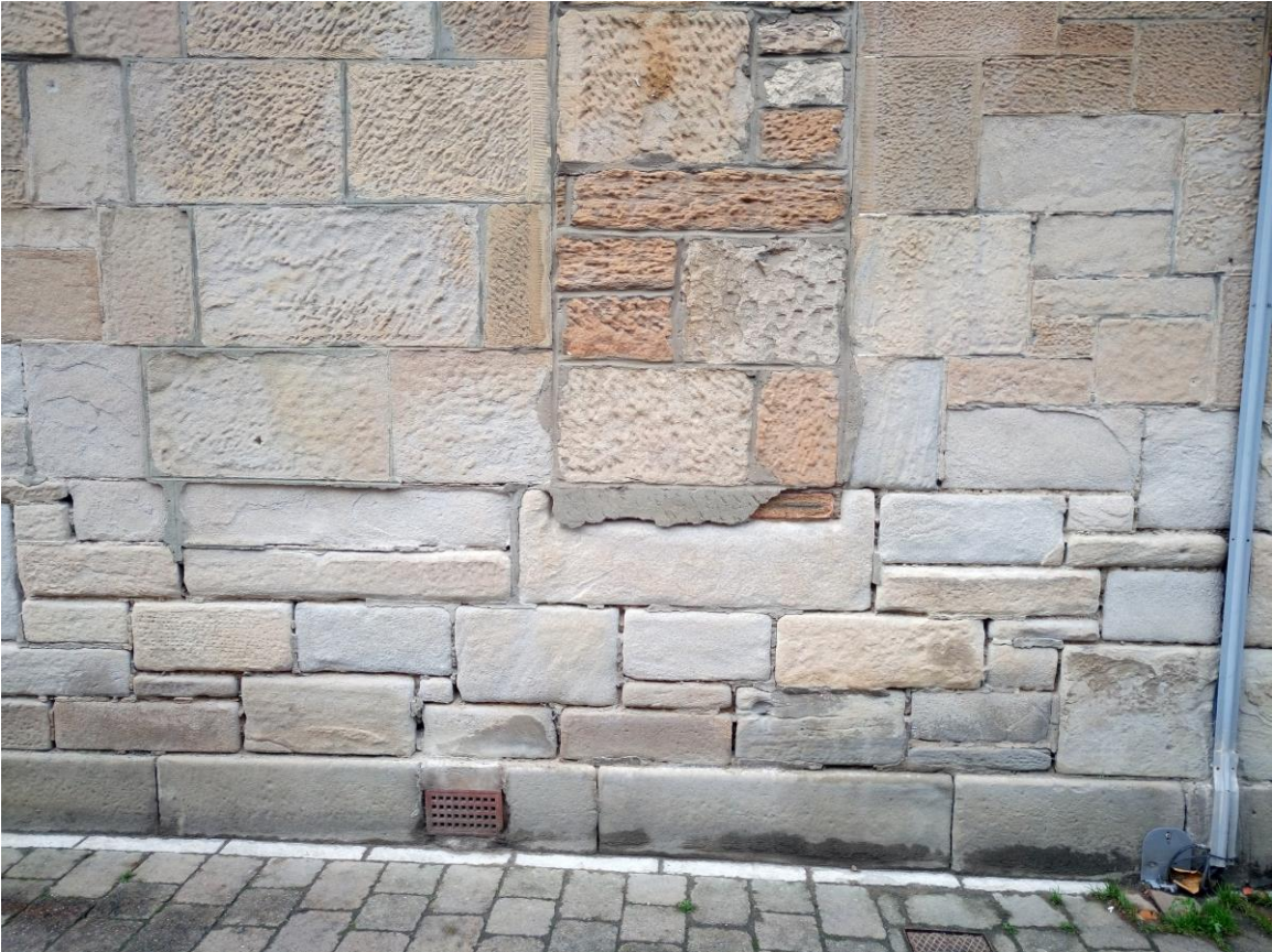
Figure 1: Advanced deterioration of a 19 th century sandstone ashlar masonry façade in Bearsden, Scotland.