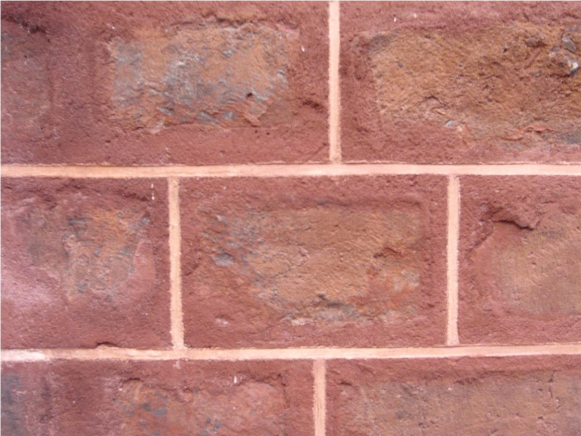
Figure 7: Mortar repair of degraded bricks allows a better appreciation of the architecture of the