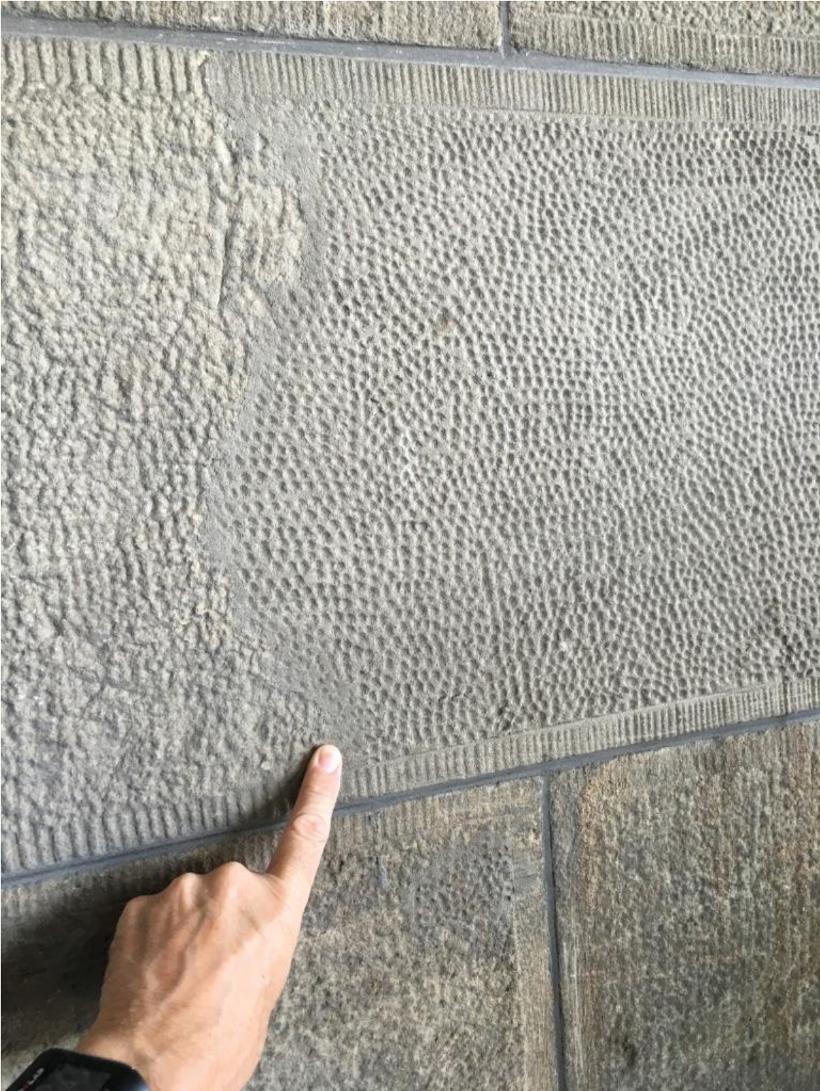
Figure 10: Stone repair (right side). Texture is adapted to the original substrate finishing technique.