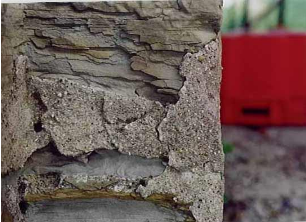
Figure 5: Failure of the surface repair due to mechanical incompatibility of the cement based mortar. Calcitic sandstone, Bergamo, Italy.