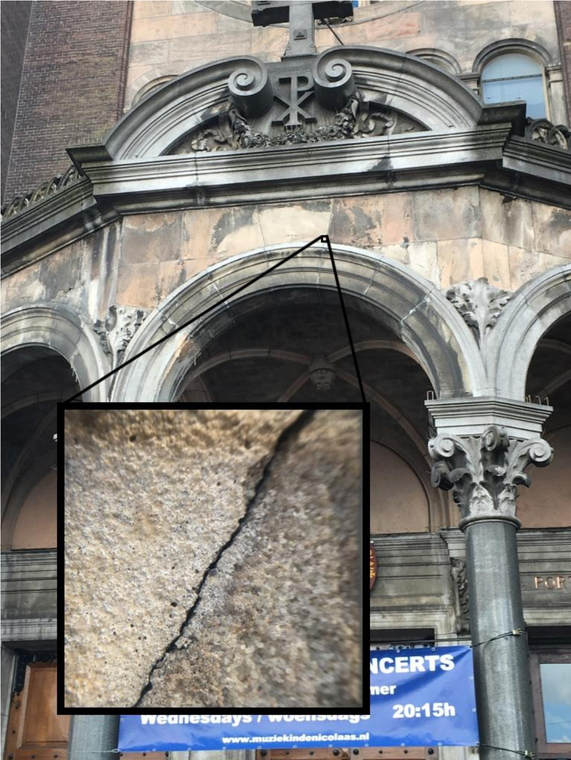
Figure 12: Stone repair with detail of a failing bond, due to shrinkage of the repair mortar. Amsterdam.