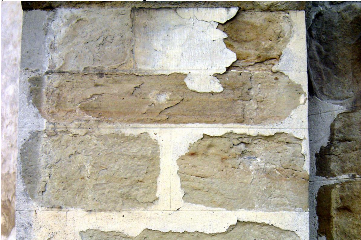
Figure 4: Mortar repair of a stone unit. Stone continues to decay. The repair material is durable but helps to accelerate decay of the adjacent stone as it collects rain water at the edges. Slovakia.