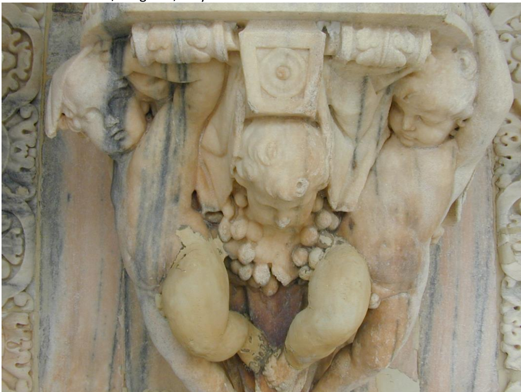
Figure 6: Alteration of appearance of epoxy resin-based repair mortars (angle's legs) on marble. Candoglia marble, Duomo di Milano, Italy.