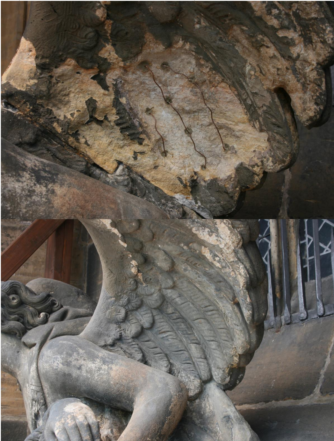
Figure 9: Mortar repair carried out on sandstone cenotaph sculpture of St. Jan of Nepomuk from 18 th Century. Note the keying system of wires used to aid repair adhesion. St. Vitus Cathedral, Prague.

was used to slow down the degradation rate of stone. It was used to fill deeper voids but the weathered stone blocks were not remodelled to their original shape, see the detail of masonry with patches of mortar. Palazzo Piccolomini, Pienza, Italy.