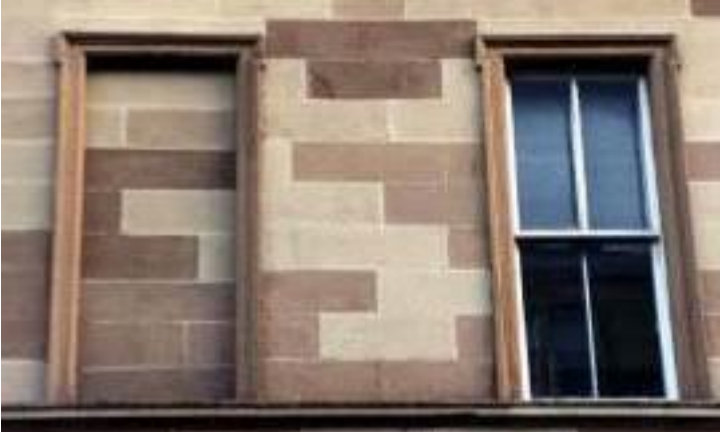
Figure 2: Example of mortar application (light parts) as a mortar repair of deteriorated stone units in Glasgow, Scotland.